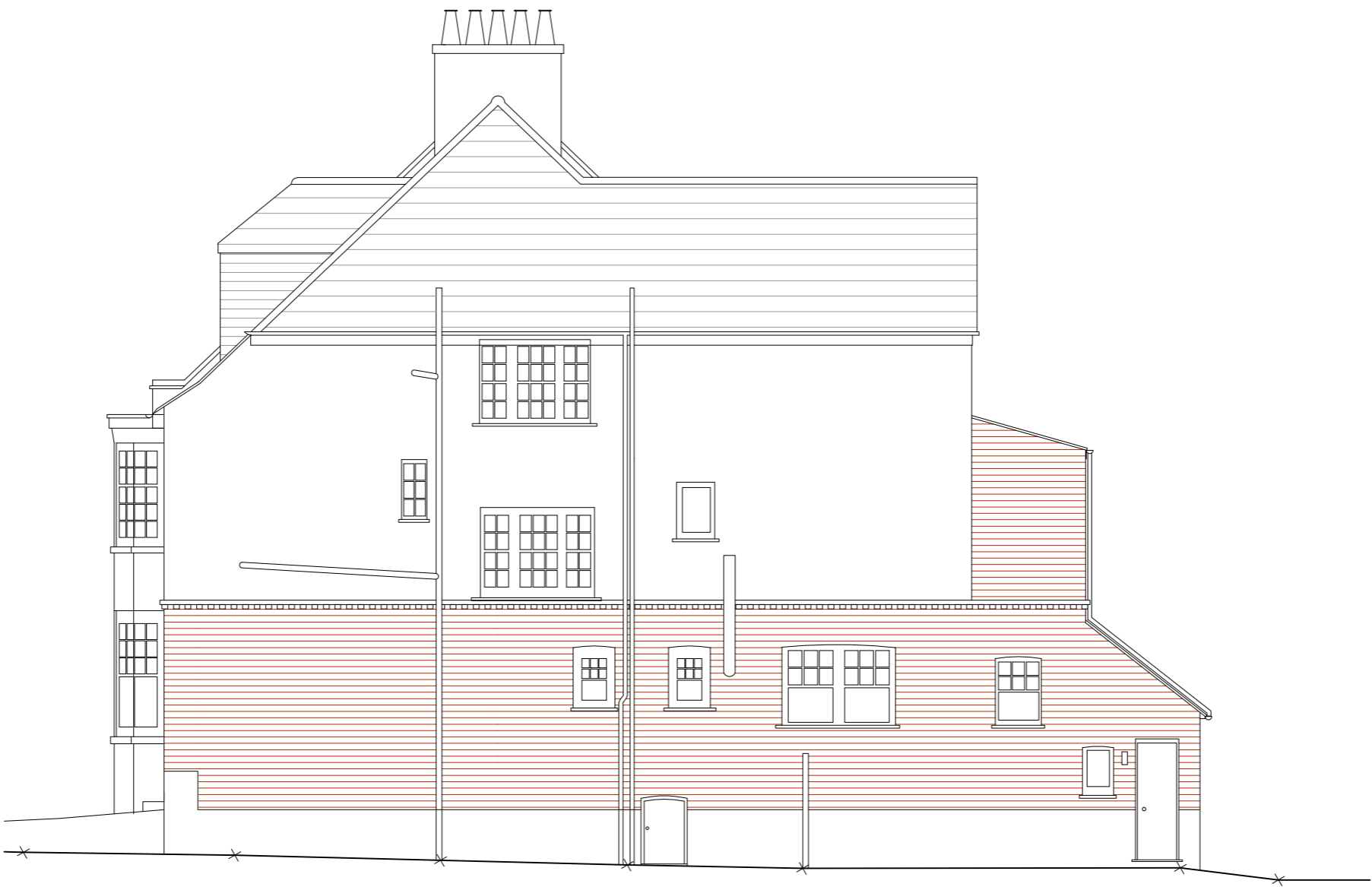
1 EXISTING SIDE ELEVATION 1 : 100

USE FIGURED DIMENSIONS ONLY. DO NOT SCALE FROM THIS DRAWING. ALL DIMENSIONS MUST BE CHECKED ON SITE & ANY INCONSISTENCIES MUST BE REPORTED BACK TO THE ARCHITECT. THIS DRAWING AND ANY DESIGNS INDICATED THEREON ARE THE COPYRIGHT OF THE ARCHITECT. ALL RIGHTS ARE RESERVED. NO PART OF THIS WORK MAY BE REPRODUCED WITHOUT PRIOR PERMISSION IN WRITING FROM THE ARCHITECT.