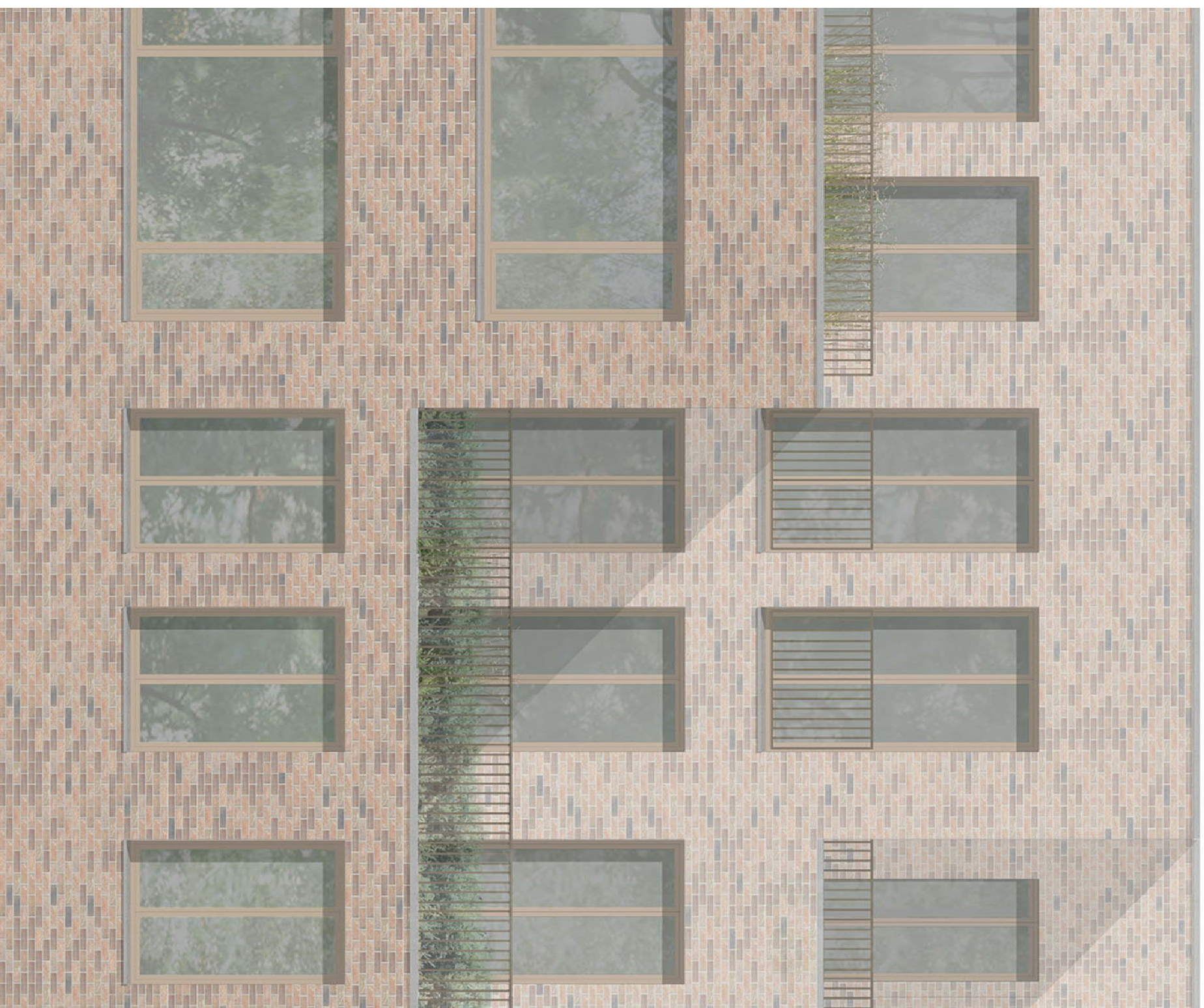
Workspace Building South Elevation