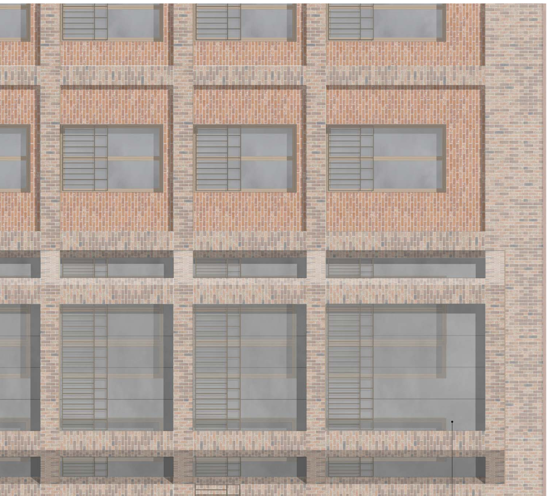
Residential Block B East Elevation