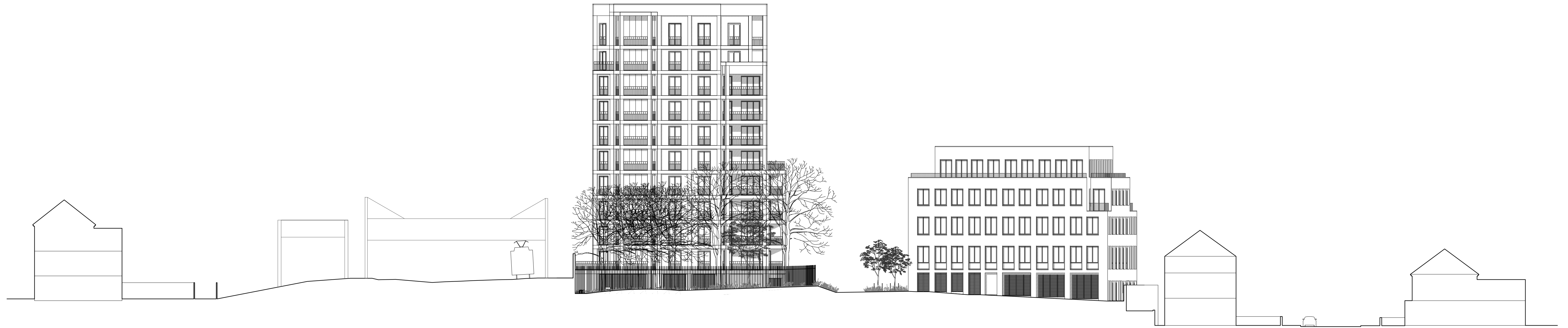
PROPOSED CONTEXT SECTION SE2