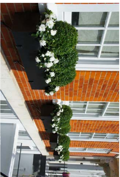
④CAST IRON RAILINGS/HANGING PLANTS