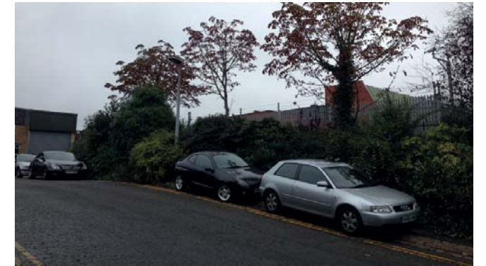
Existing planting to retain