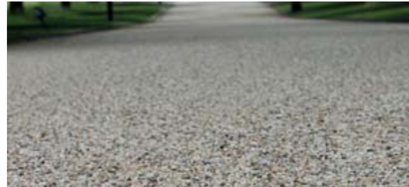
Permeable resin bond surface

This access will be used as the main drop off and pick up point for school children during the Phase 2 construction works, and will be surfaced with resin bonded gravel. Two operational parking spaces are to be provided for school use at the side of the access. The majority of the existing hedge planting will be retained, supplemented by new tree planting to complement the Maygrove Road woodland and form a green link to the school nature garden and the railway corridor.