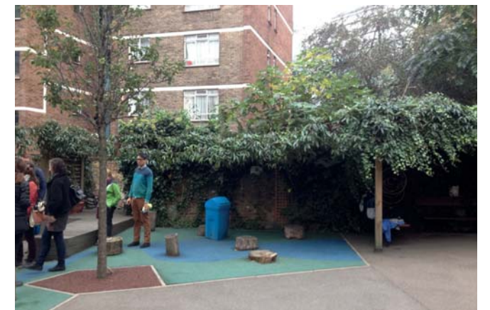
Structure with climbers