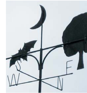
Wind and Weather Reading