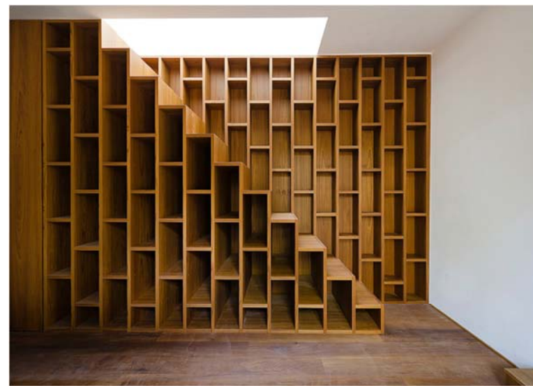
4 1:50 PRECEDENT IMAGE - Staircase / in built furniture