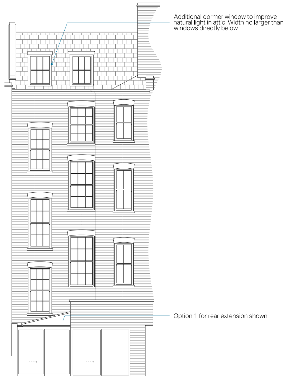
5 1:100 PROPOSED REAR ELEVATION