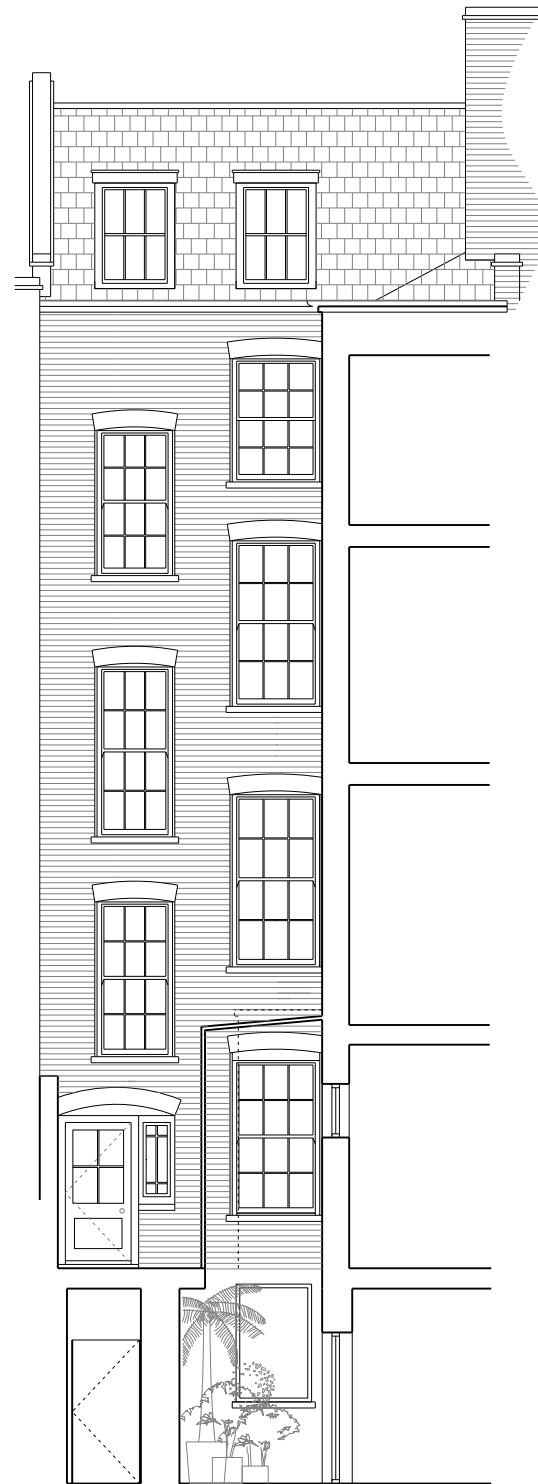
1c 1:50 SECTION