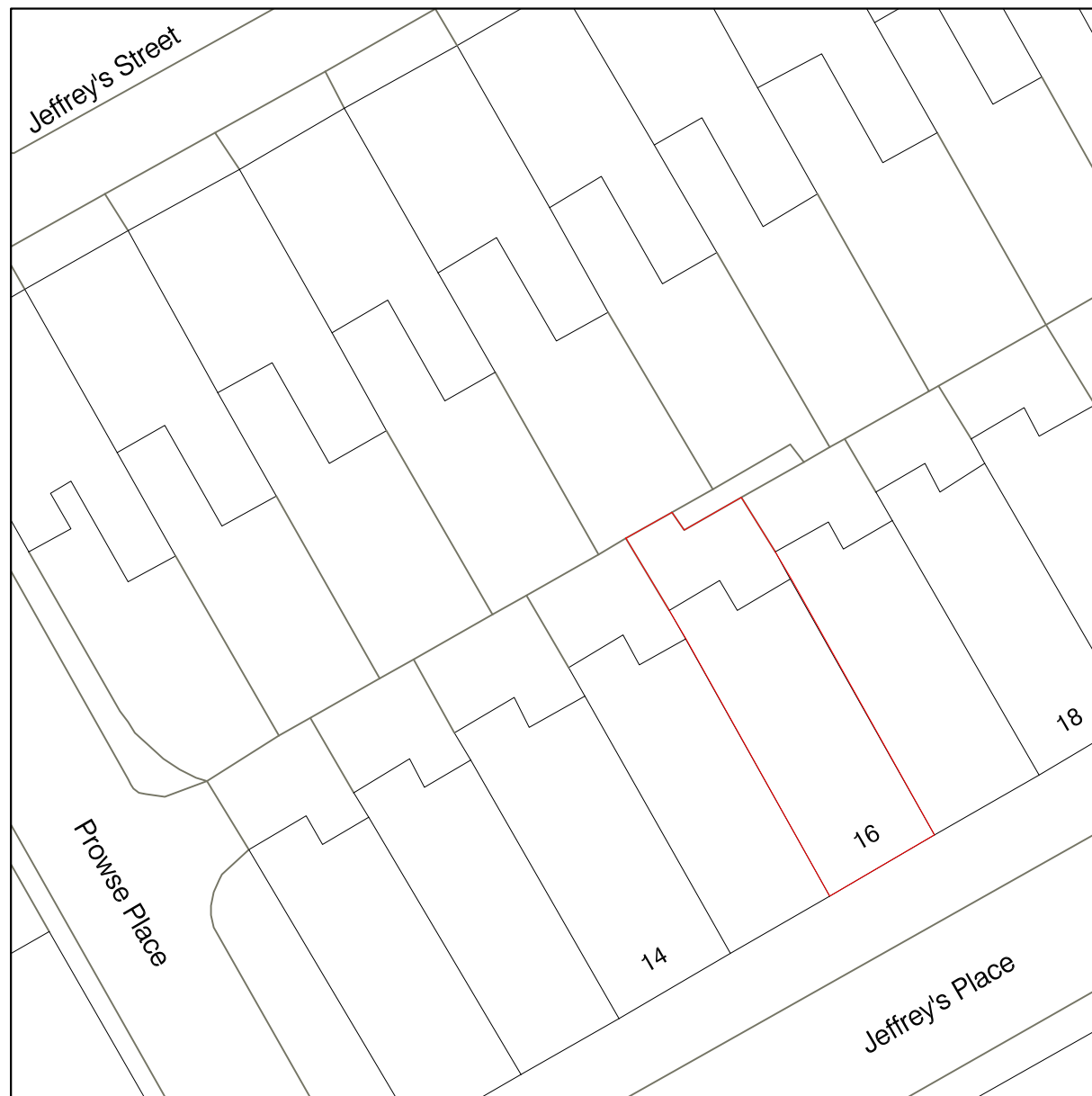
01 EXISTING LOCATION PLAN scale 1:1250