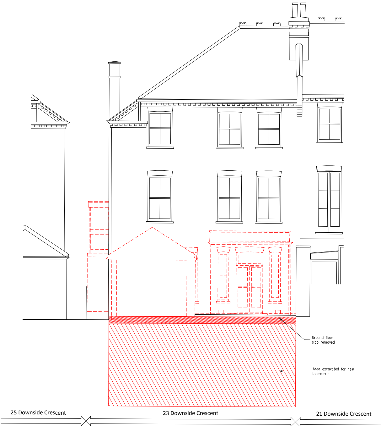
EXISTING SECTION CC Scale 1:50@A1