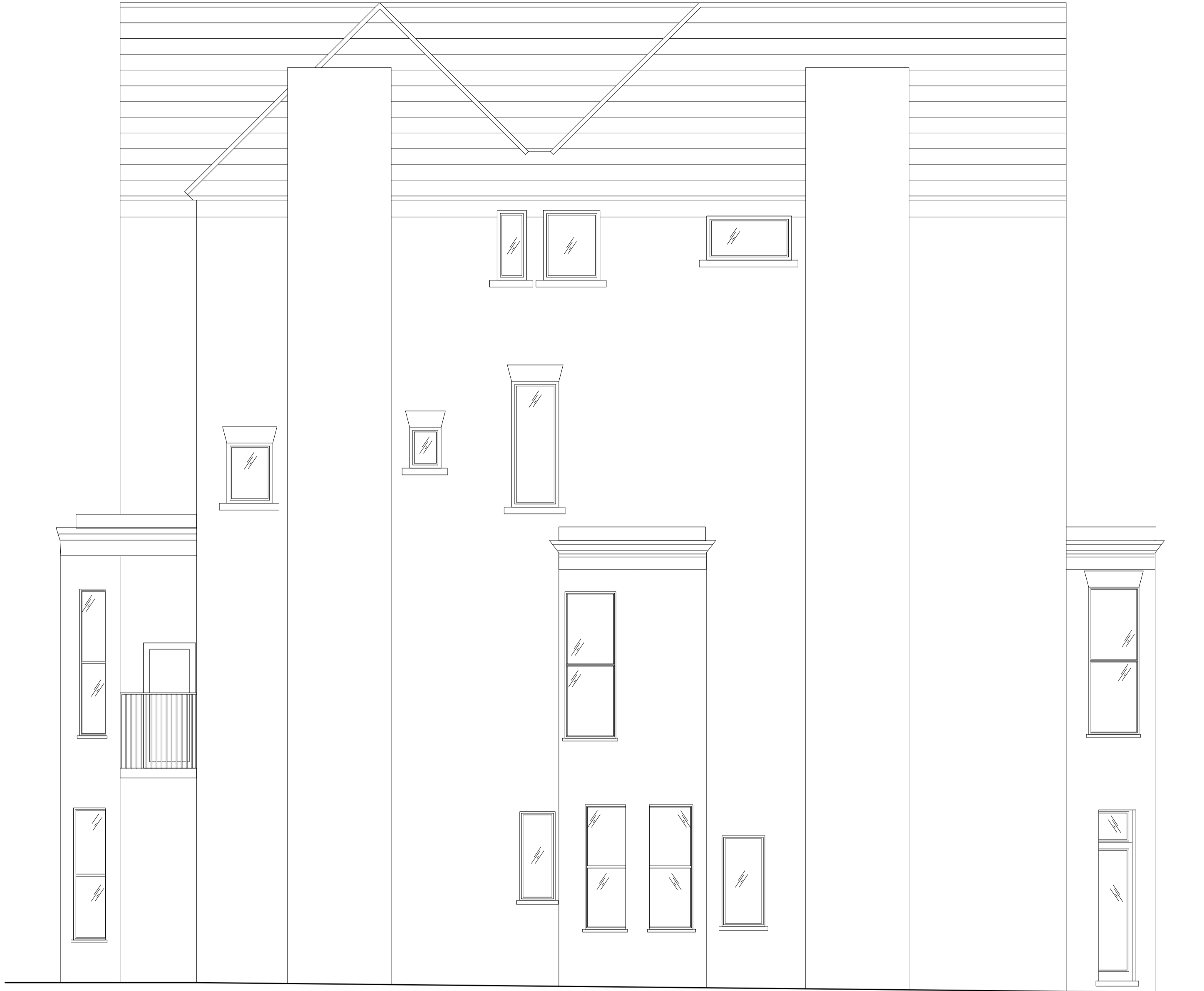
EXISTING ELEVATION D