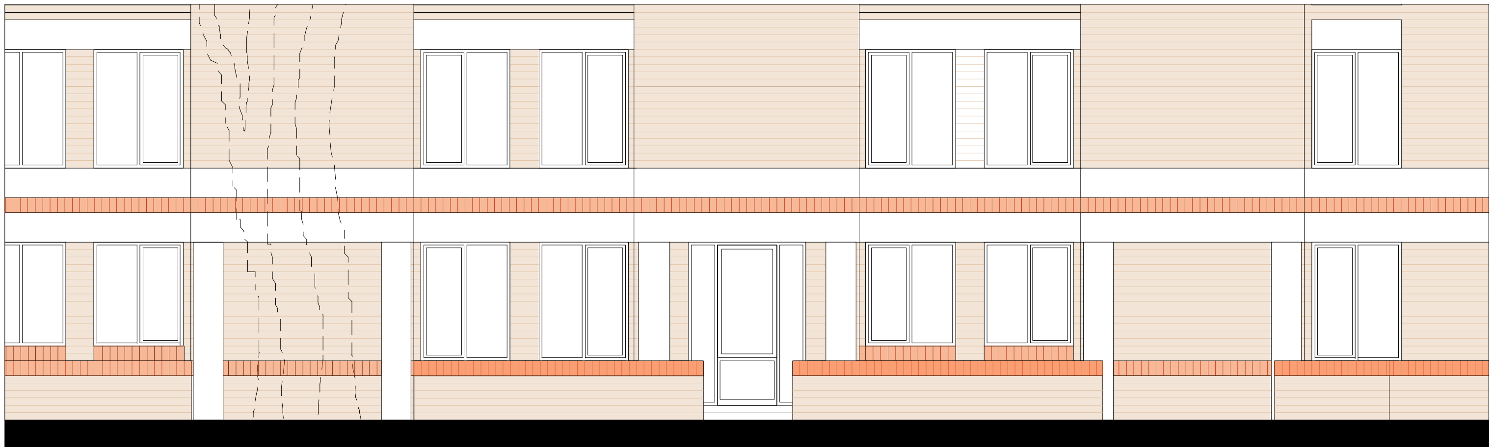
PARTIAL SOUTH ELEVATION SHOWING FLAT 5 AS PROPOSED