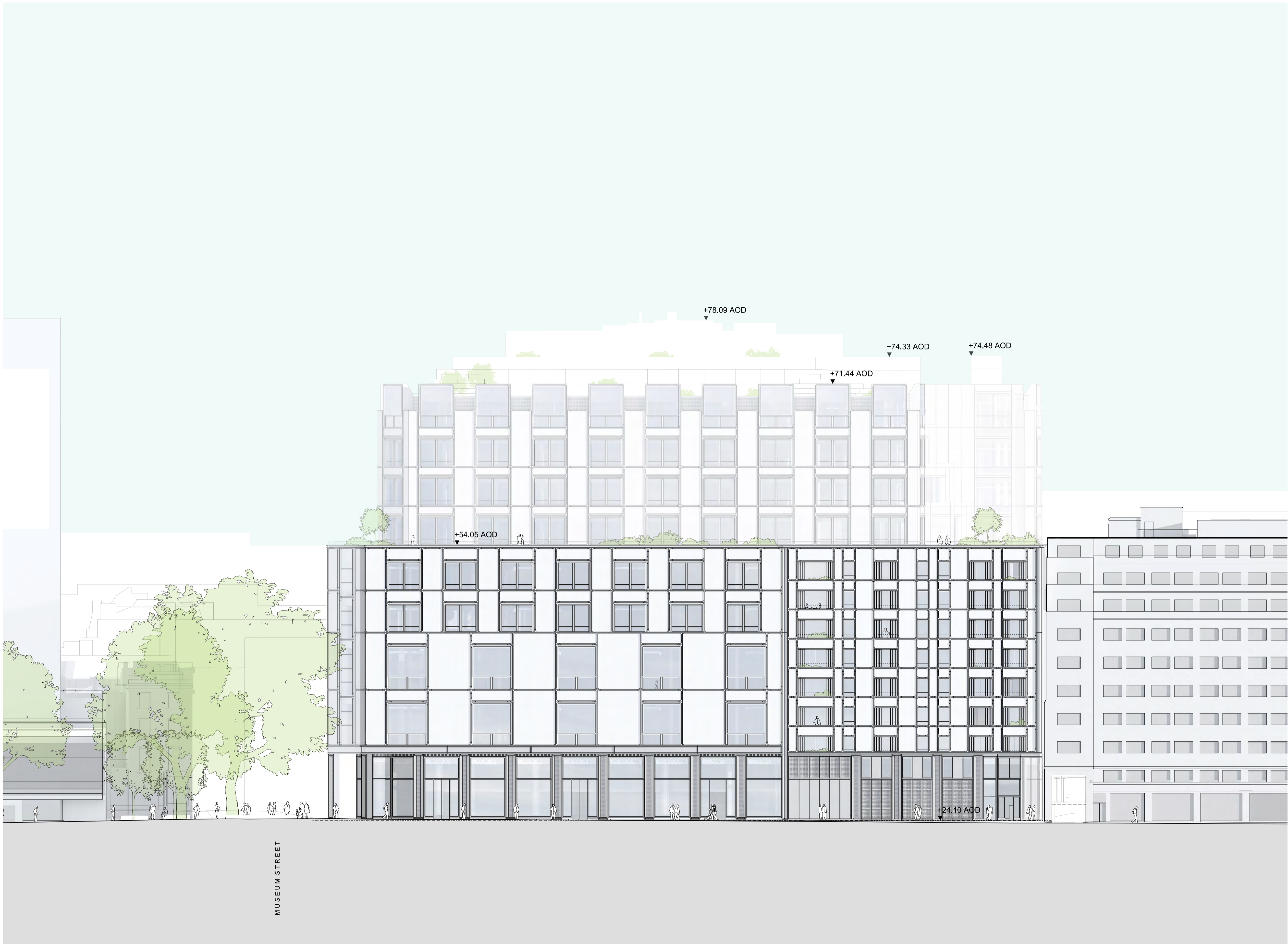
SOUTH ELEVATION - PROPOSED