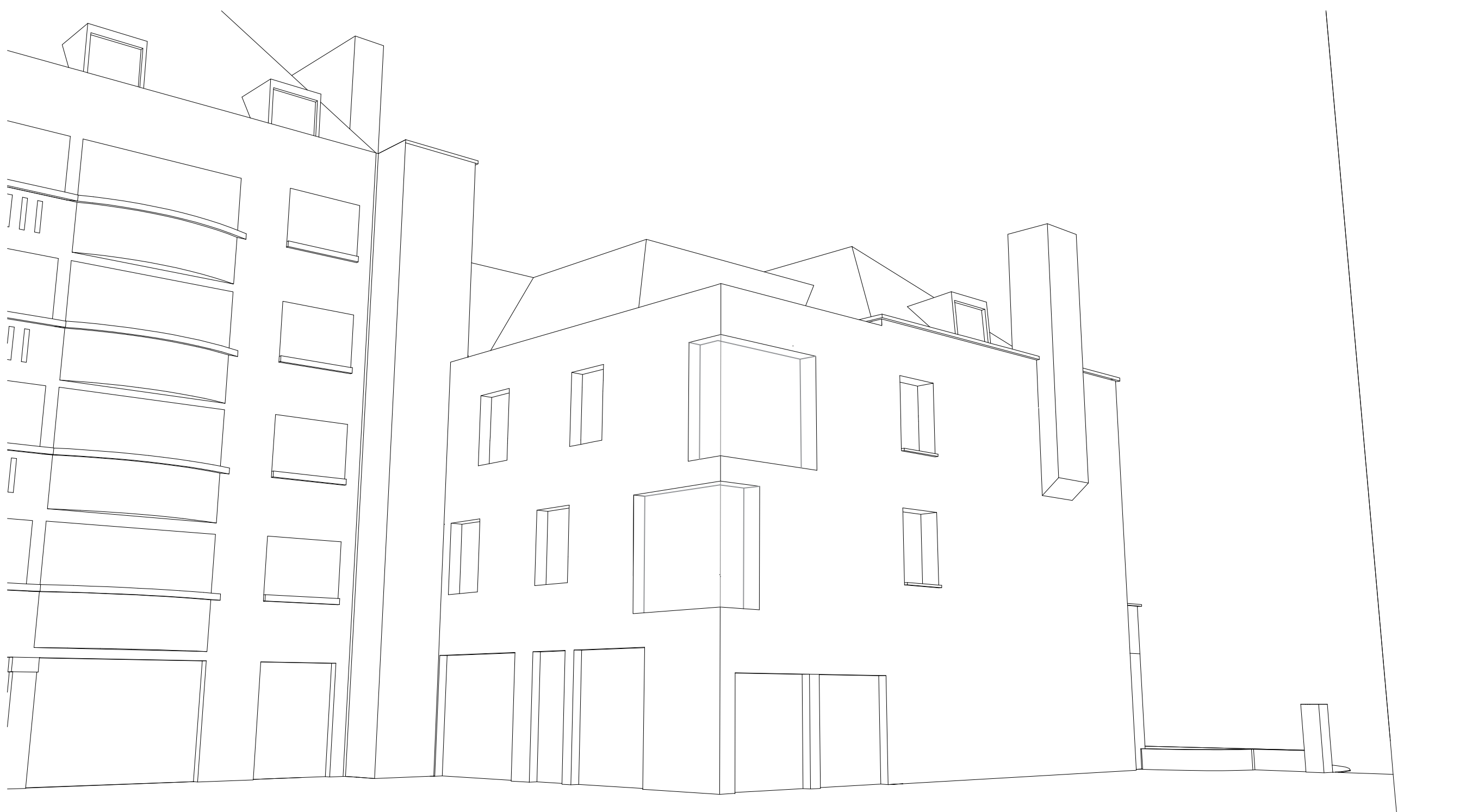
3 PROPOSED REAR VIEW (INTERIM)