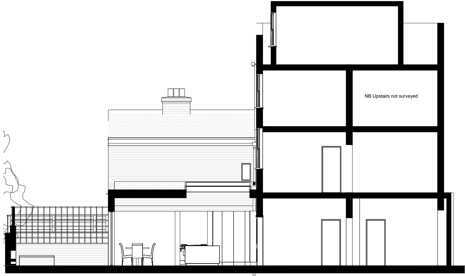
A PL Proposed Section AA 1 : 100