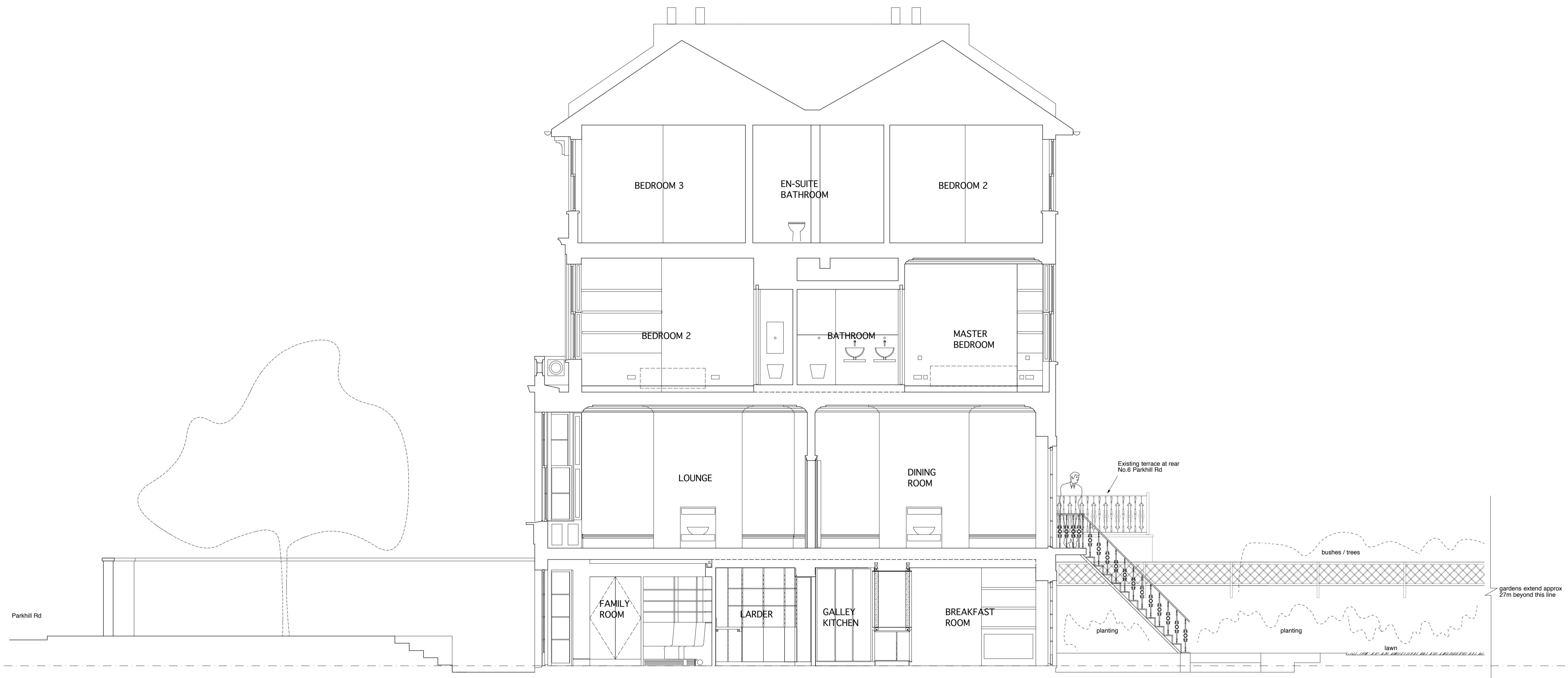
EXISTING SECTION - AA