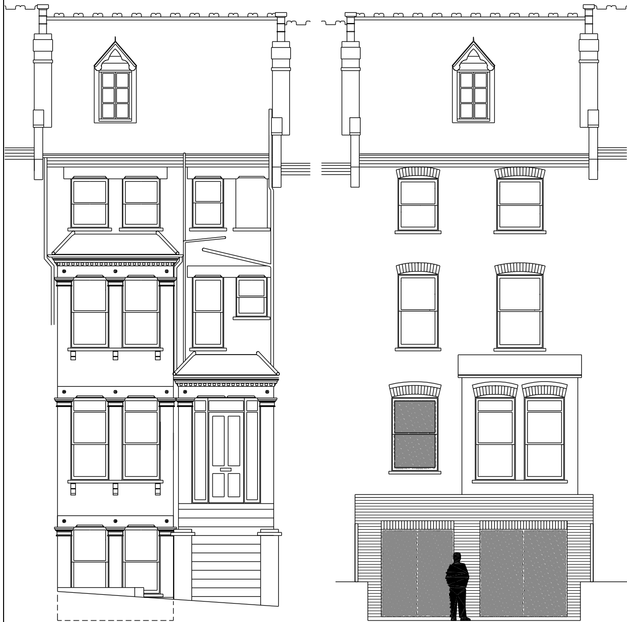
FRONT ELEVATION - SOUTH