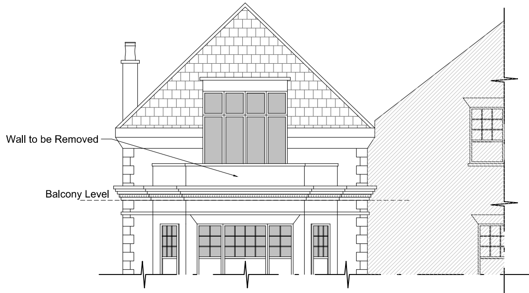
03 Existing Rear Elevation SCALE 1:100 @ A3