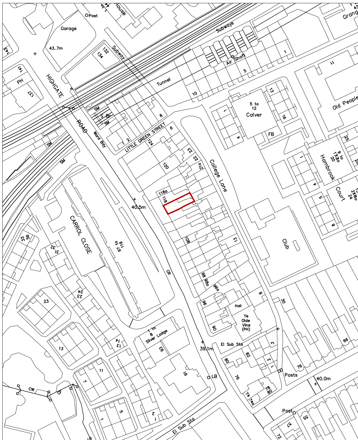
SITE LOCATION SCALE 1:1250

Note: This drawing has been drawn to scale for the purposes of obtaining local authority approval. Any measurements required for construction must not be scaled from this drawing. All structural elements to be agreed with local authority Building Control prior to commencement of works. Attention is drawn to the provisions of the party wall act 1996. Legal boundaries should be determined by others.