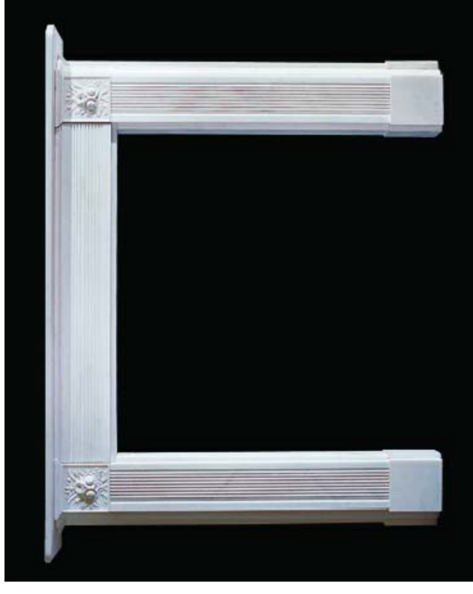
EXISTING FIRE SURROUND 'Cheltenham' from 'Chesney's Regency Collection' Material Used - White Marble