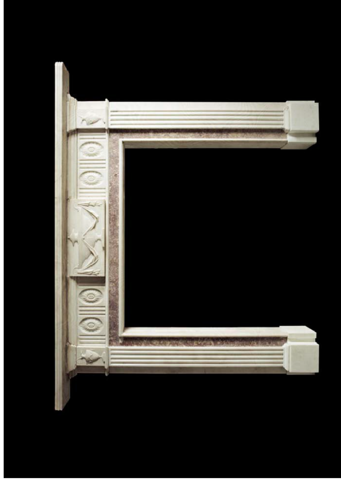
PROPOSED FIRE SURROUND 'Pattern 4' from 'Chesney's Regency Collection' Material Used - White Marble