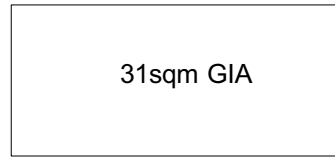
Proposed partially excavated existing basement area