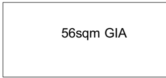
Proposed newly fully excavated basement areas