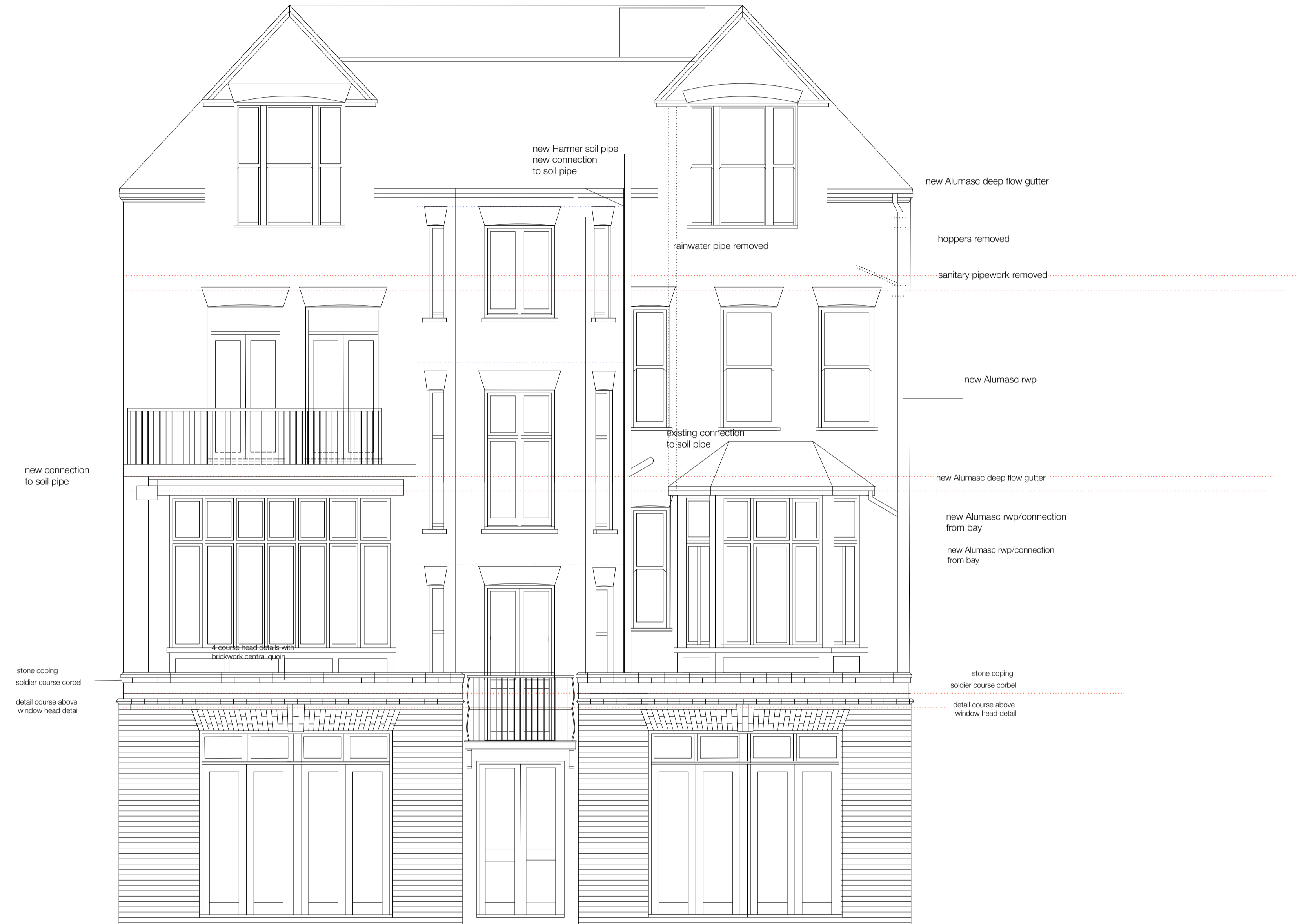
elevation as proposed

C Detail amend 05/12/14 B DRAFT AMENDMENTS 20/11/14