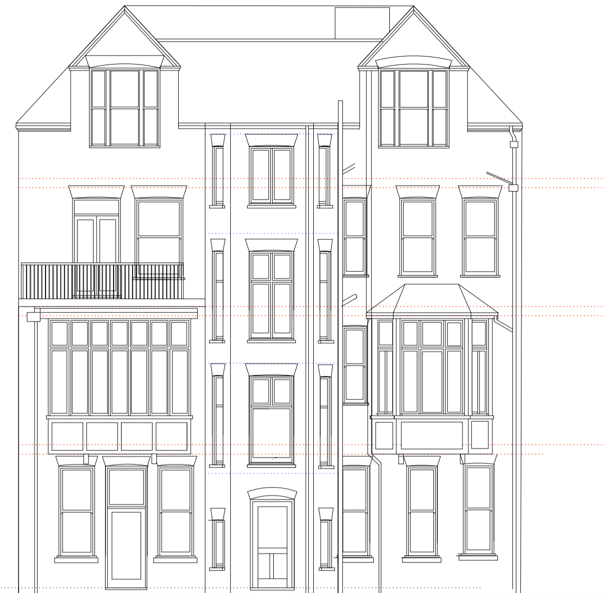
elevation as existing