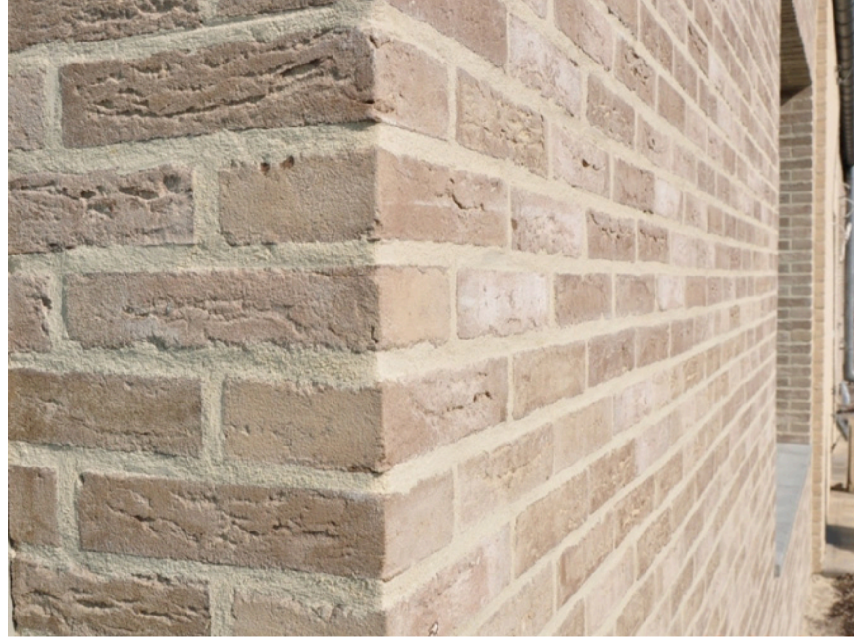
BROMO BRICKS - GREY/WHITE MULTI COLOUR BRICK WITH HANDMADE TEXTURE