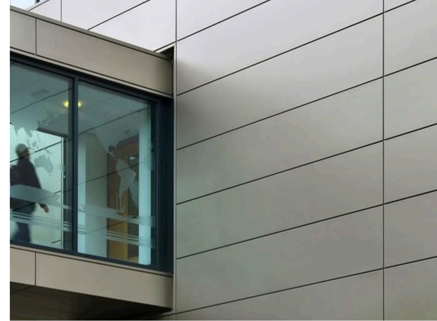
EXAMPLE OF ANODISED ALUMINIUM RAINSCREEN CLADDING