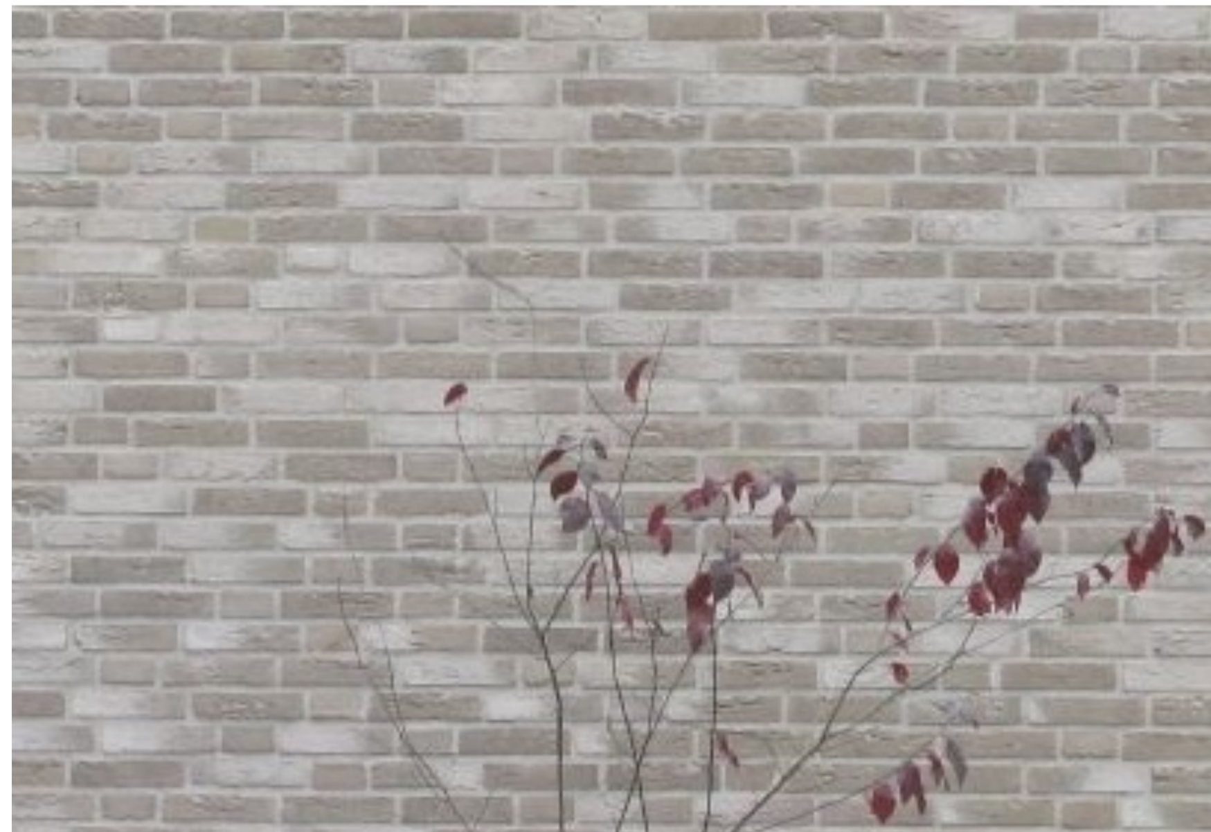
BROMO BRICKS - GREY/WHITE MULTI COLOUR BRICK WITH HANDMADE TEXTURE