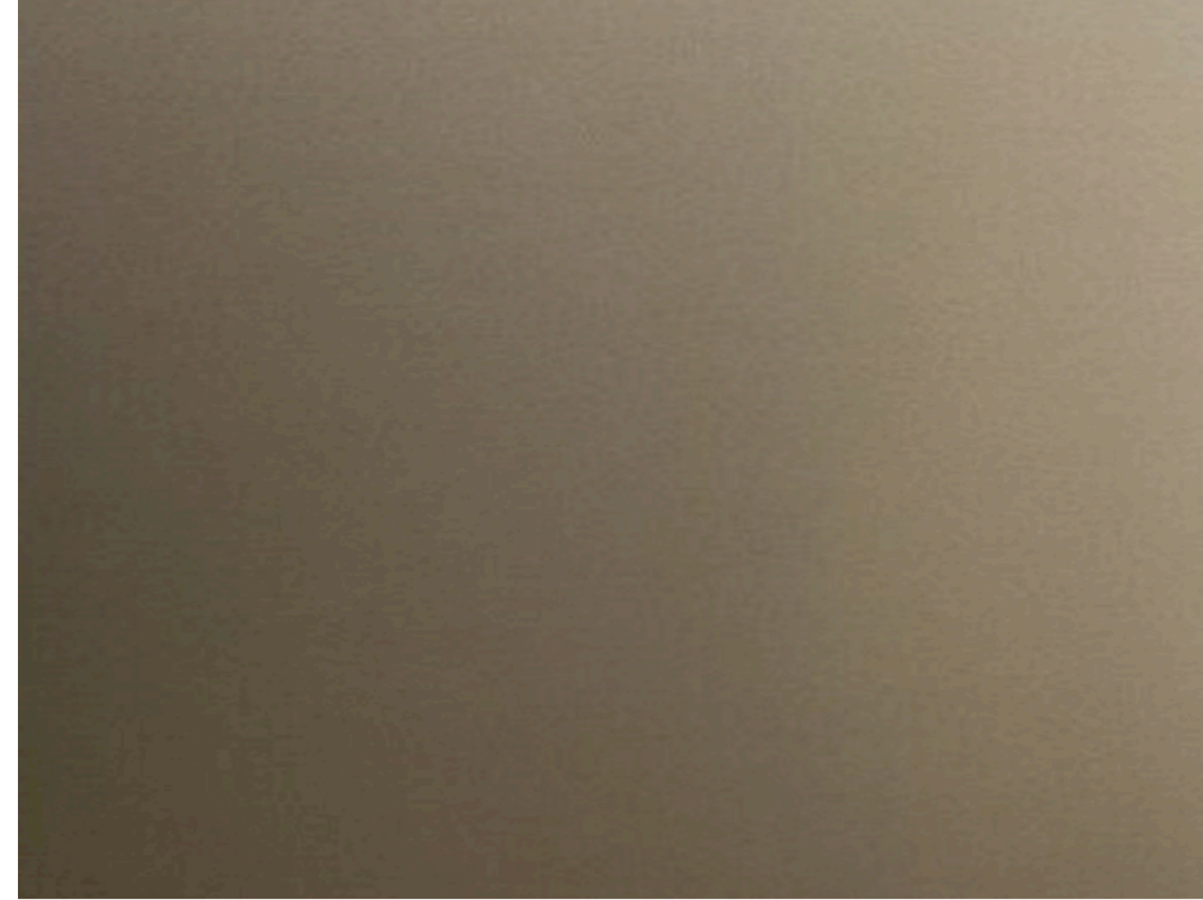
RAL 1035 - PEARL BEIGE FOR ALL METALWORK INCLUDING ALUMINIUM WINDOWS, CAPPINGS, BALUSTRADES