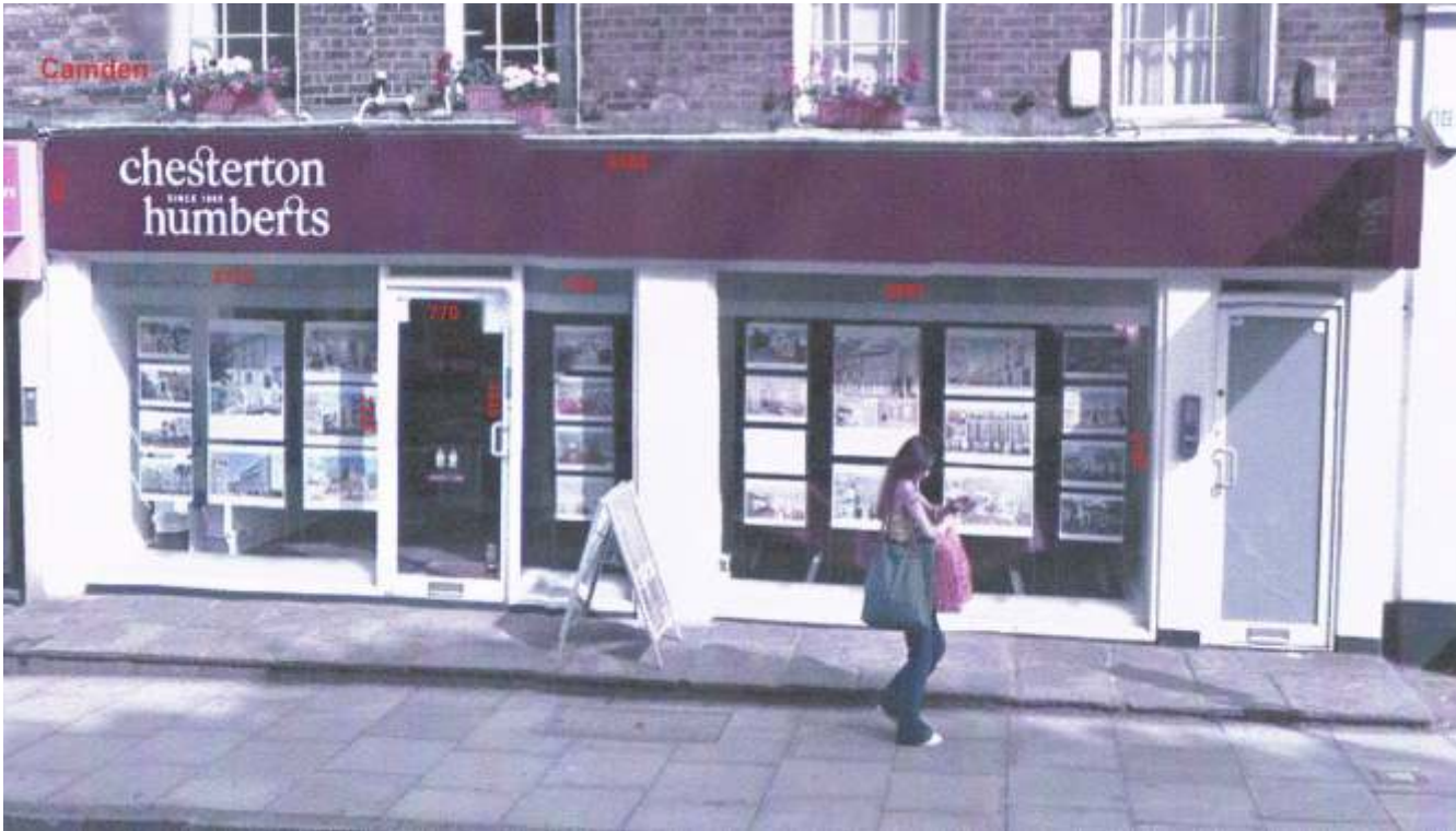
FASCIA FRONT ELEVATION (EXISTING)