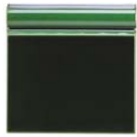
VICTORIAN SKIRTING TILES VICTORIAN GREEN FIELD TILE 150X150 BY ORIGINALSTYLE.COM