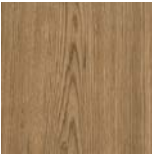
NATURAL OAK FINISH FOR ENTRANCE DOOR