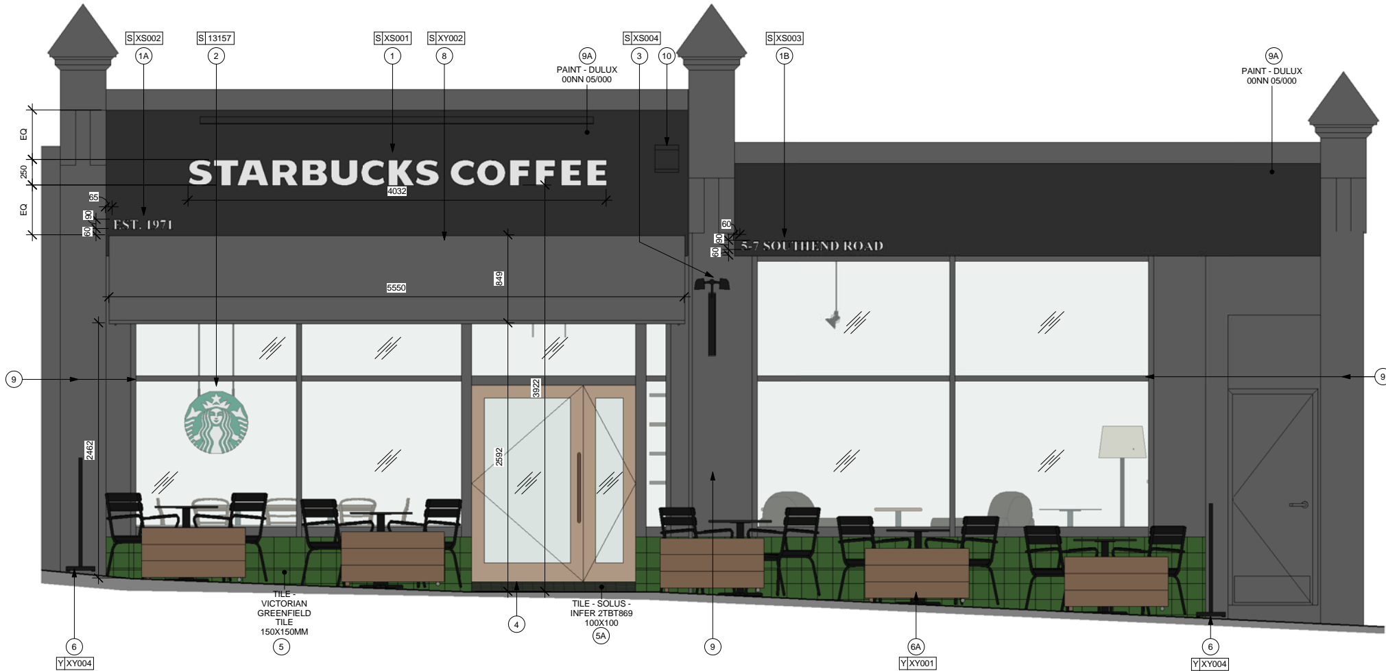
1 PROPOSED FRONT ELEVATION Scale: 1 : 25