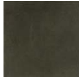
BRONZE IRONMONGERY TO MATCH MT0005 SUPPLIED BY GC