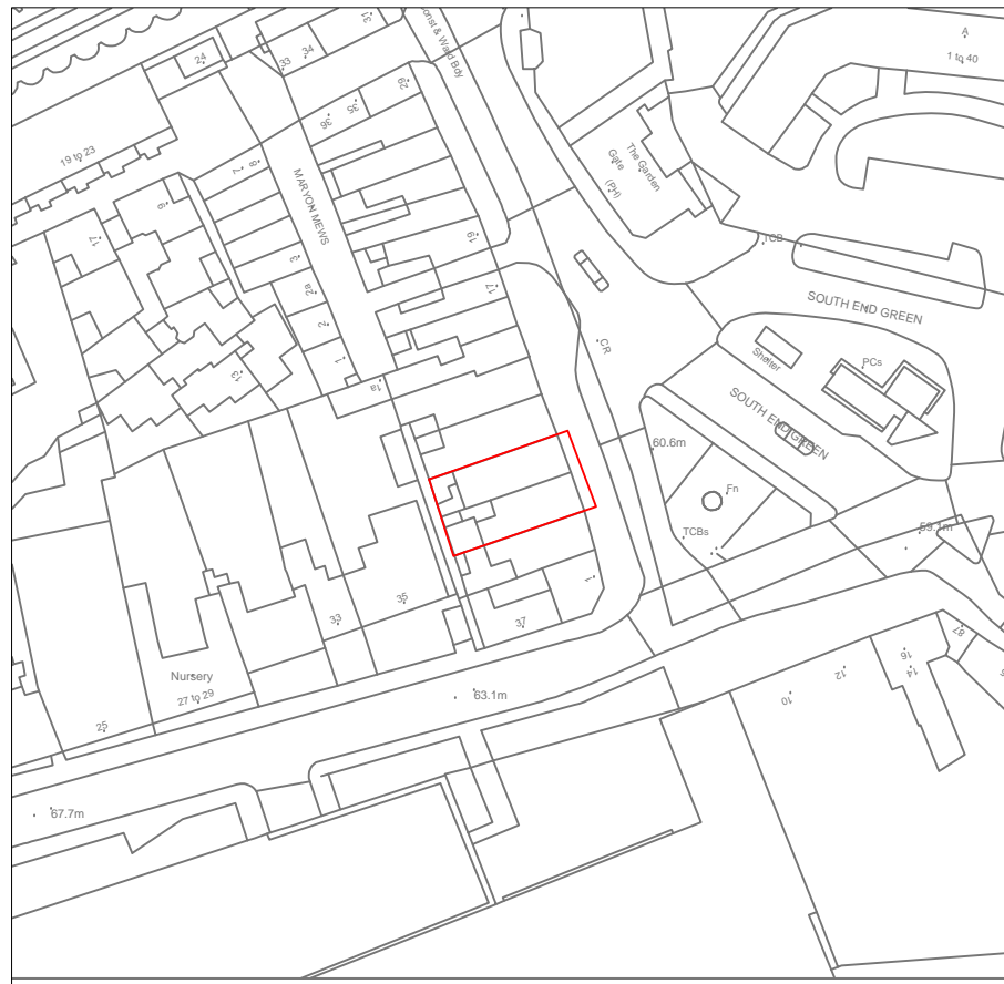
SITE LOCATION PLAN - SCALE: 1:1250 @ A3 SITE AS OUTLINED IN RED STARBUCKS COFFEE SHOP 5-7 South End Road, London, NW3 2PT

ORDNANCE SURVEY MAP LICENSE NUMBER: 100041040 PLOT NUMBER: 00383185