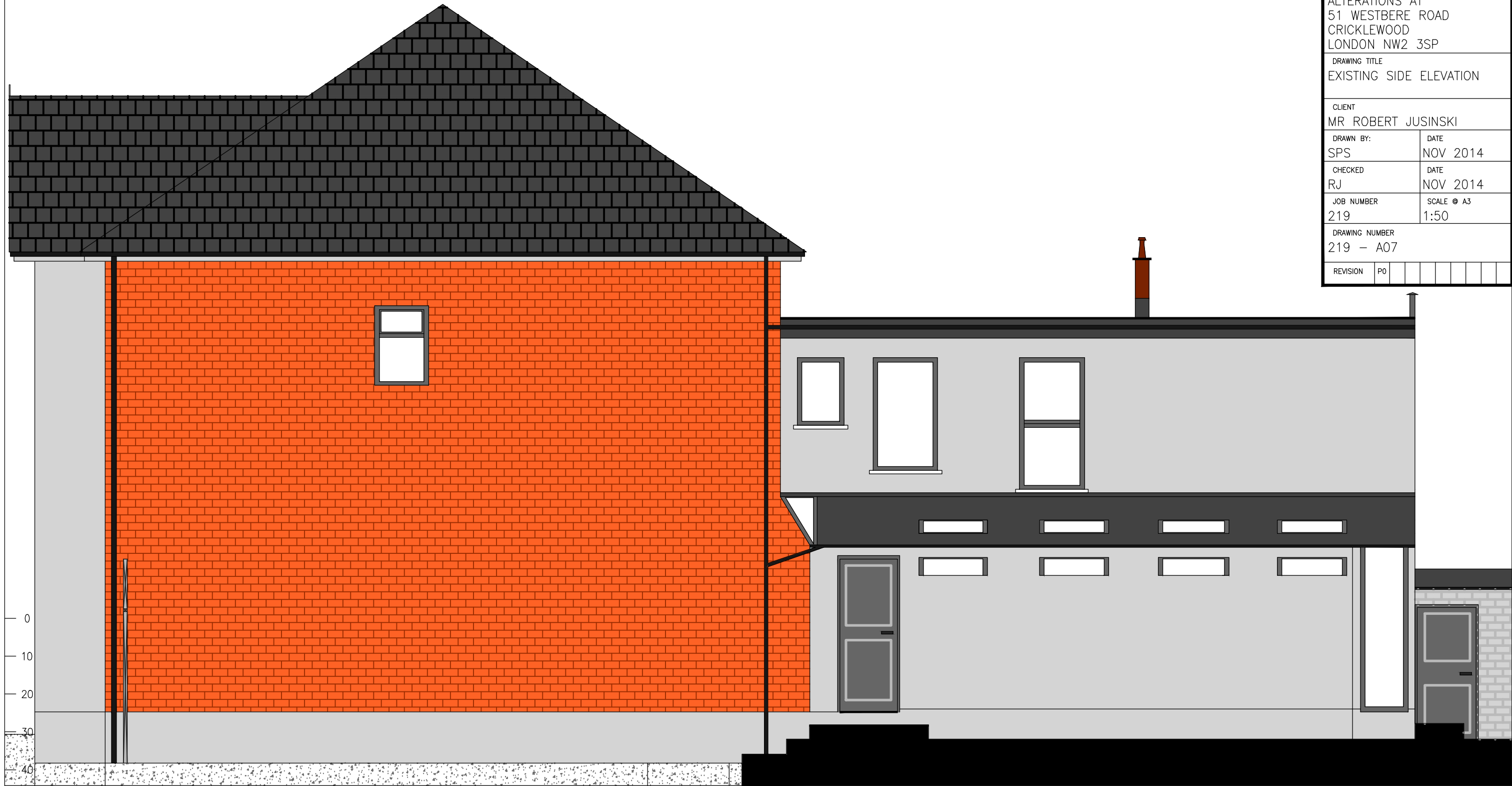
EXISTING SIDE ELEVATION SCALE 1:50

SCALE WITH CAUTION. USE BOTH SCALE BARS TO CHECK FOR REDUCTION OR DISTORTION