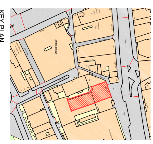
KEY PLAN NTS