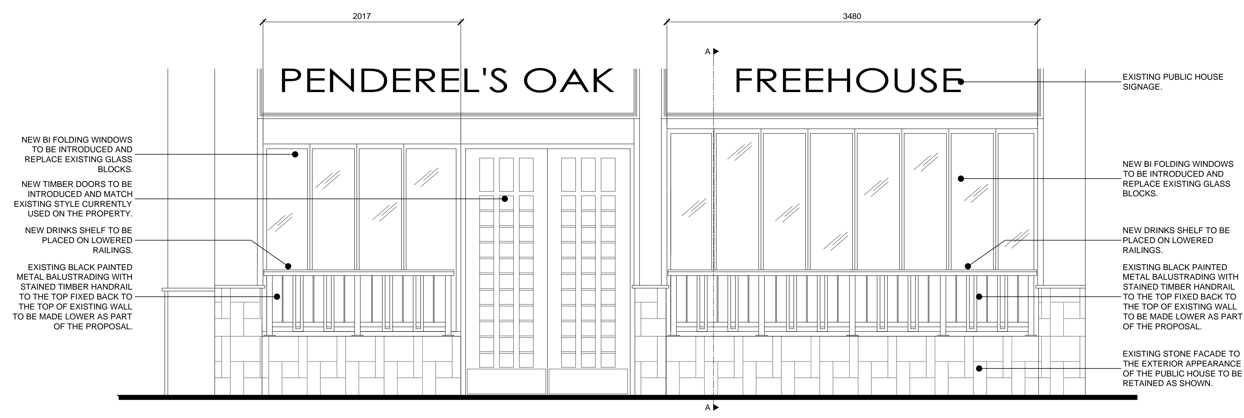
PROPOSED ELEVATION A-A Scale 1:25

NOTE: SECTIONS INDICATED ON THIS DRAWING, PLEASE REFER TO DRAWING 392-104 SECTIONAL DETAILS FOR MORE INFORMATION.