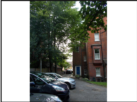
3. View of trees from the rear of the property