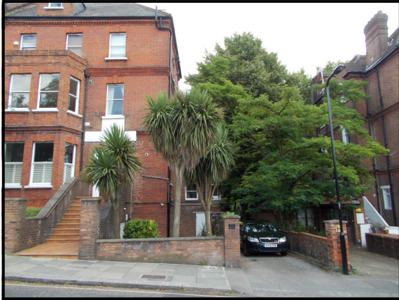
1. Front right of the property, G1 to left with T1, T2, T3, and T4 on the right.