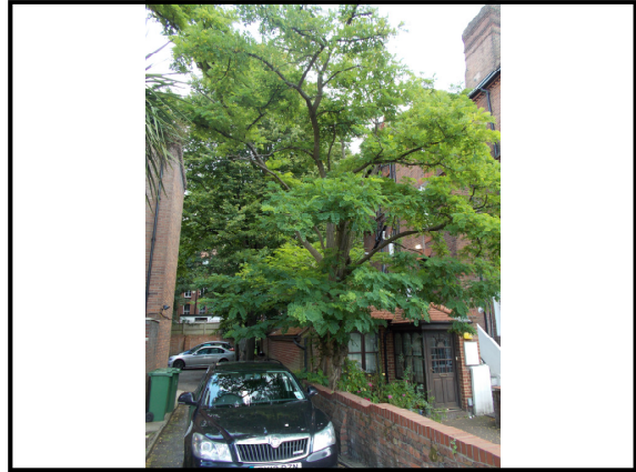
2. Close up of the trees to the right from the front, T1 at front.