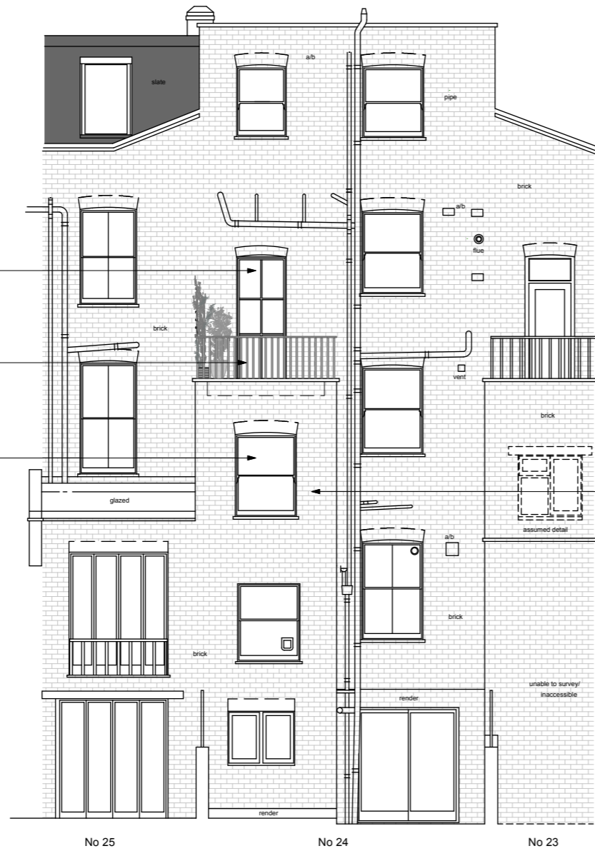
SOUTH EAST ELEVATION (Rear)

NEW TIMBER SASH WINDOW IN PROPOSED EXTENSION