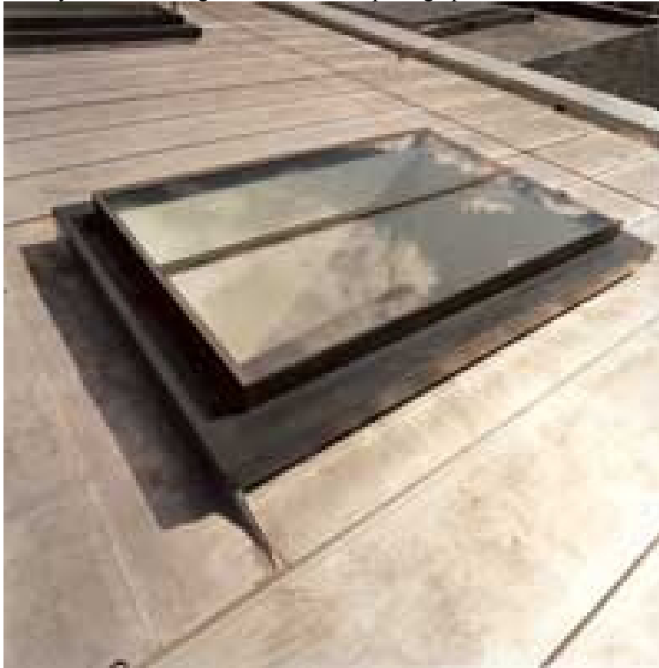
Figure 1 Proposed Conservation type rooflight

The style of the rooflight is shown in the photograph below.