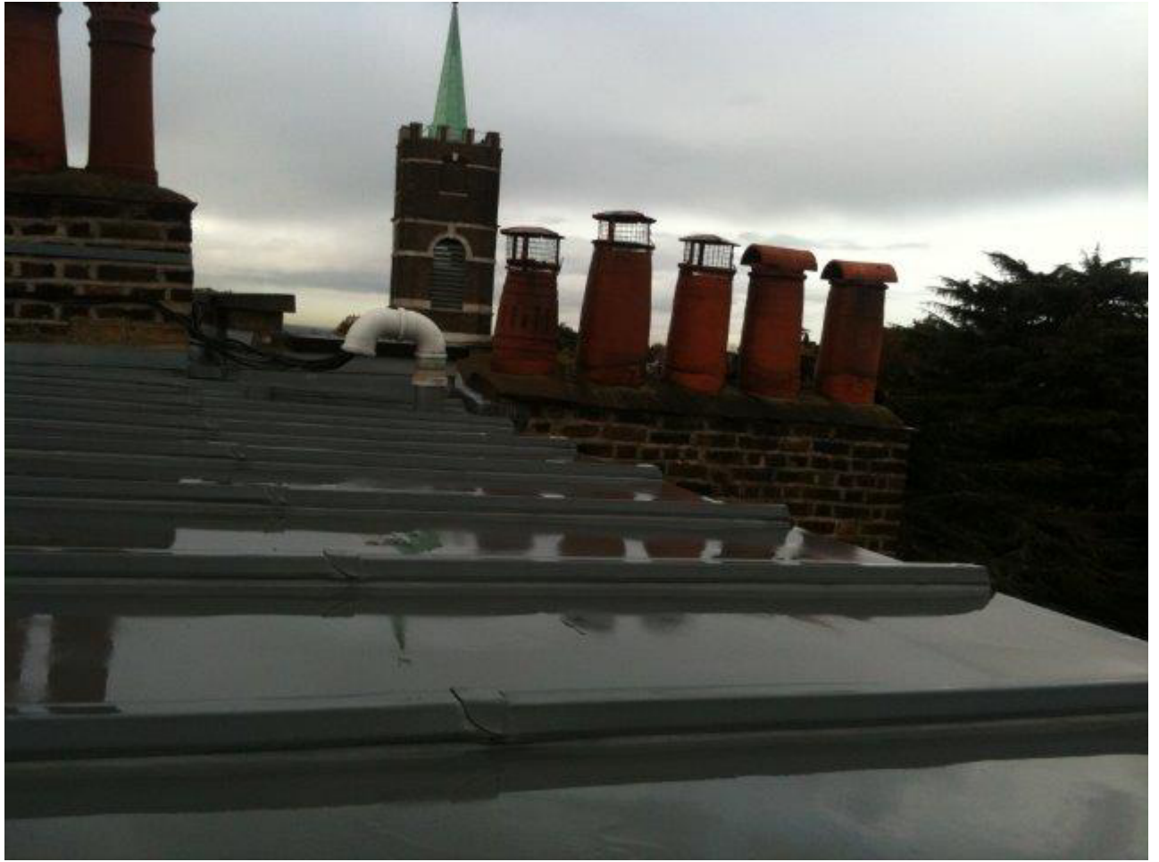
Figure 2 View to north west