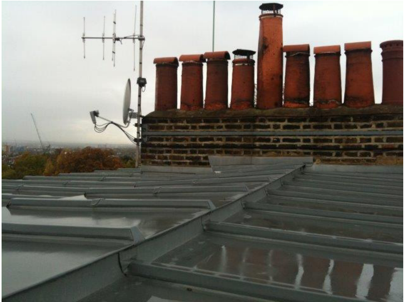
Figure 3 View to west