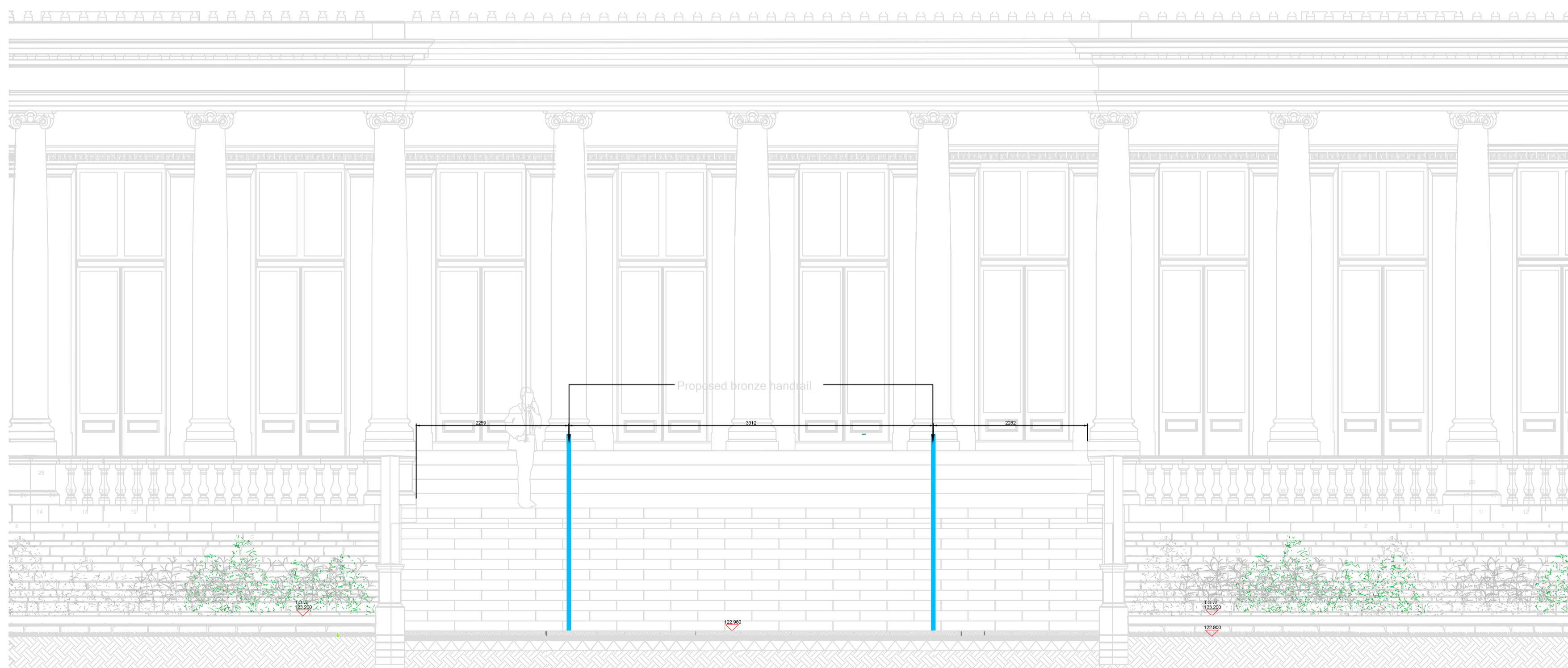
ELEVATION E1- 1:20