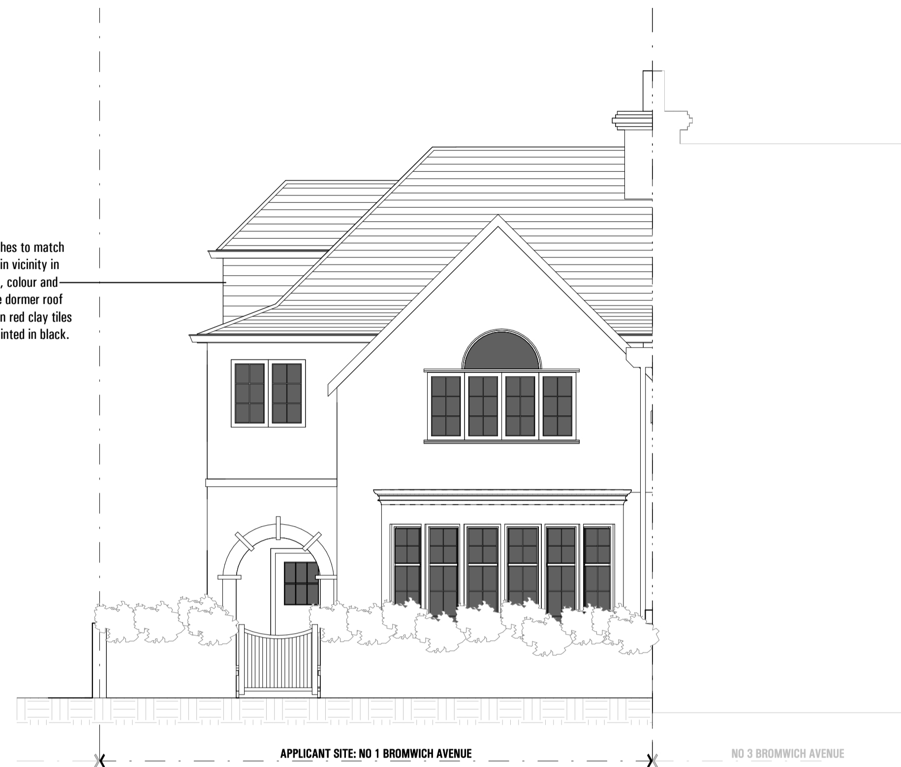
02. PROPOSED STREET ELEVATION