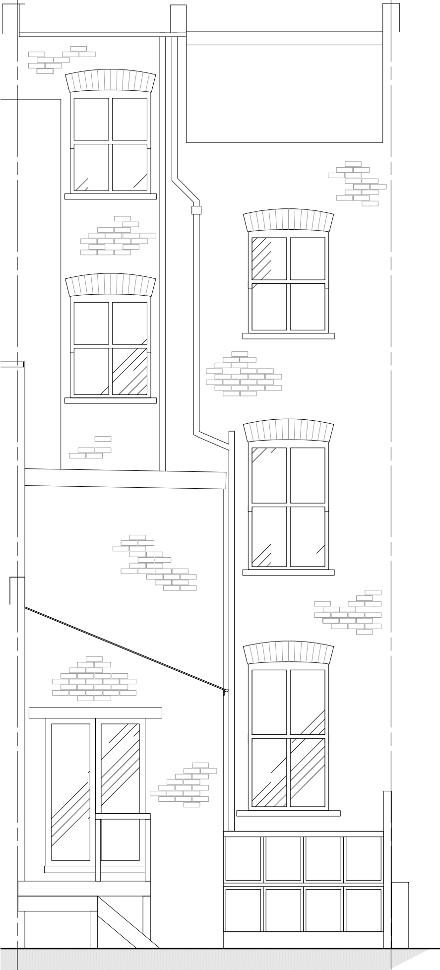
EXISTING REAR ELEVATION Scale 1:50 @ A3

This drawing is copyright. Do not scale from this drawing. All dimensions to be checked on site and any discrepancy, error or omission reported to the architect. This drawing shall be read in conjunction with all relevant architects' and engineers' drawings and specifications.