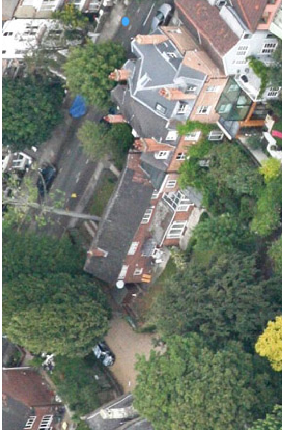
Photo 1. Aerial view