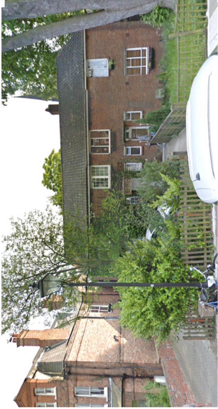
Photo 2. Front elevation