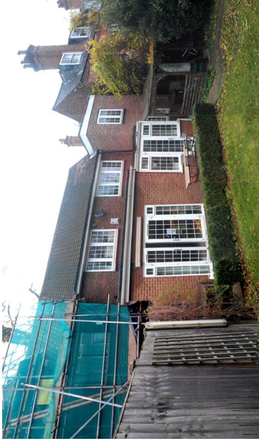
Photo 3. Rear elevation