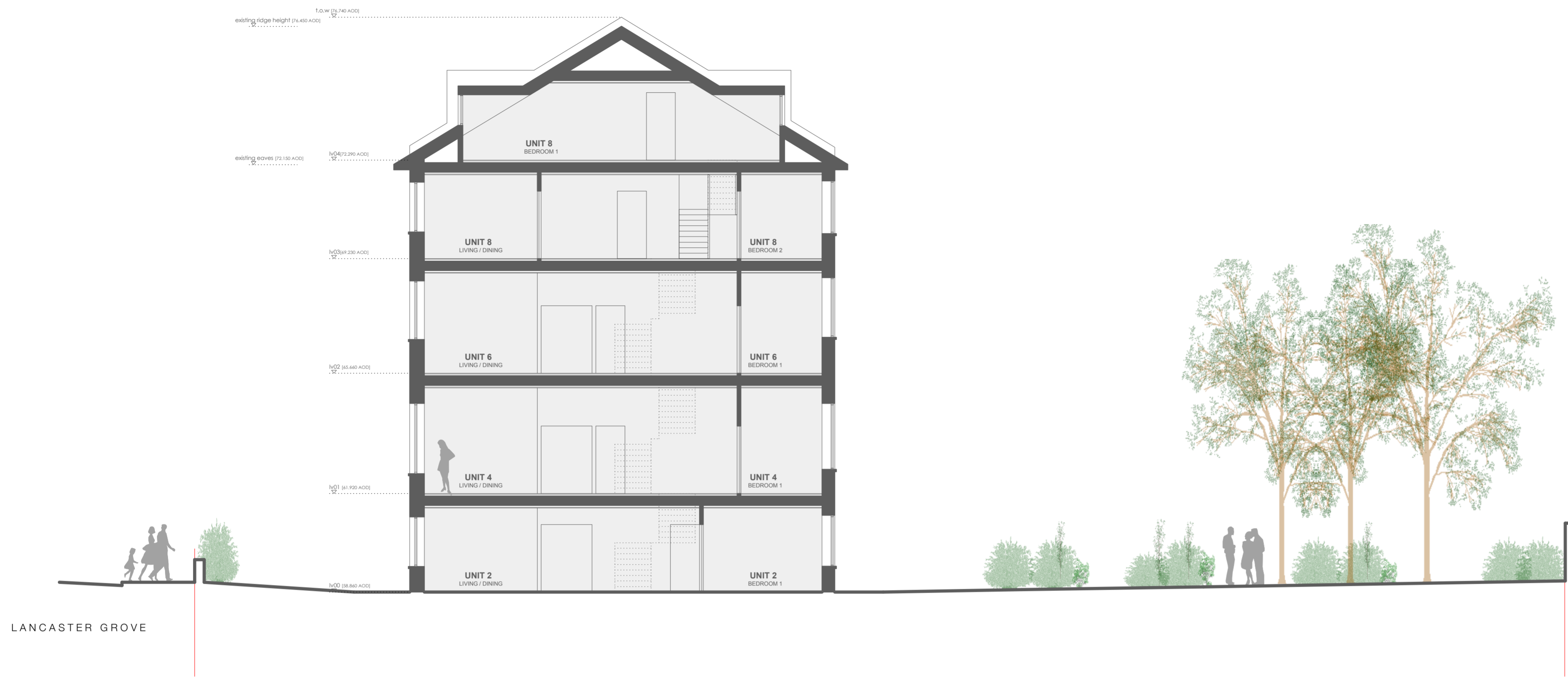
01 PROPOSED SECTION [AA] SCALE 1:100

© John Pardey Architects • Do not Scale. Used figured dimensions only. • All dimensions to be checked on site. • All drawings to be read in conjunction with engineer's drawings. Any discrepancies between consultant's drawings to be reported to the Architect before any work commences. • The Contractor's attention is drawn to the Health & Safety matters identified in the Health & Safety plan and on drawings as being potentially hazardous. • These items should not be considered as a full and final list. • The Work Package Contractor's normal Health & Safety obligations still apply when undertaking constructional operations both on and off site.