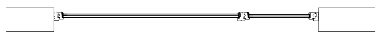
TYPICAL WINDOW SECTION (1:10)