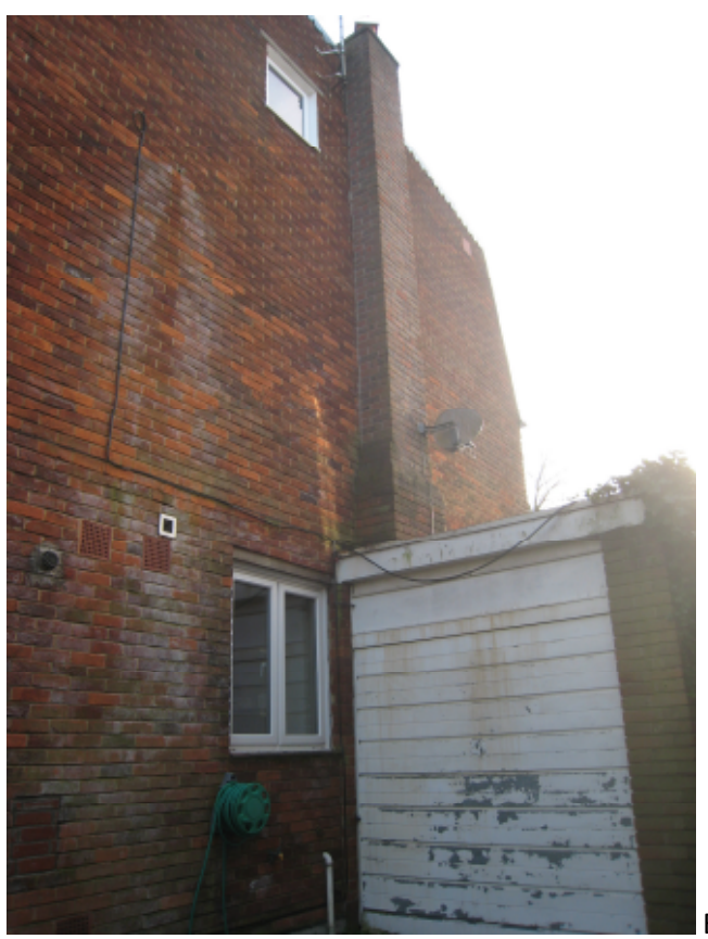
Existing side elevation