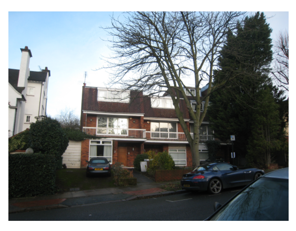
Front elevation no. 2