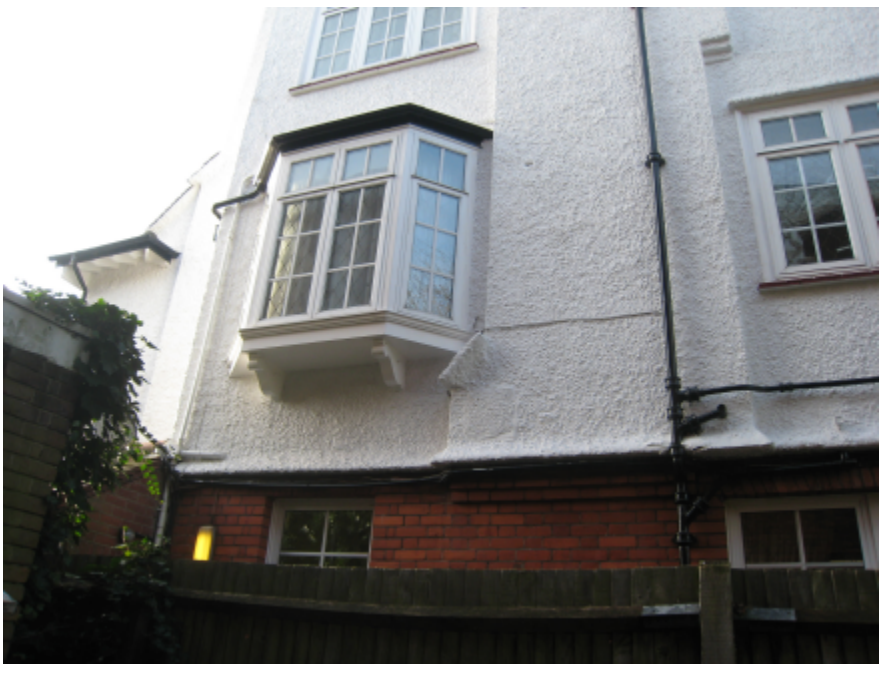
Side elevation no. 4