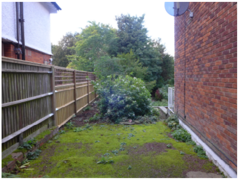
Fallen Mimosa (T4)