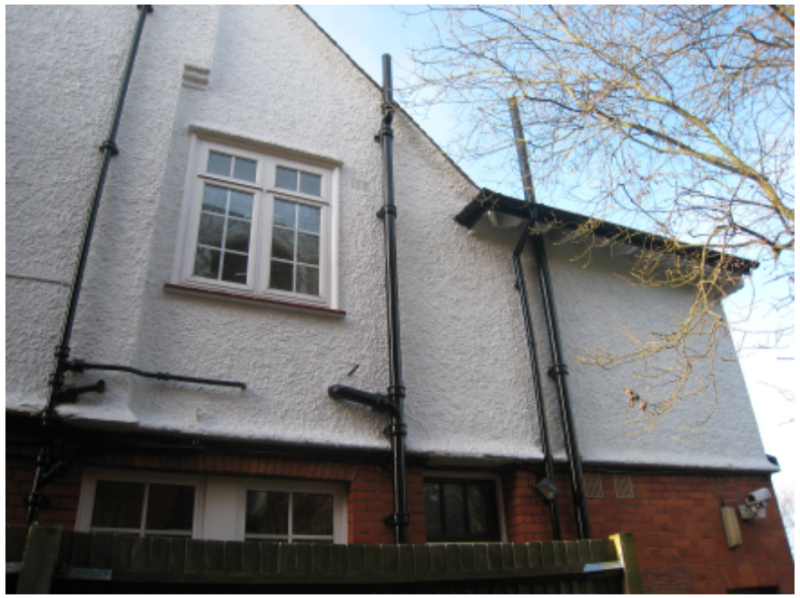
Side elevation no. 4