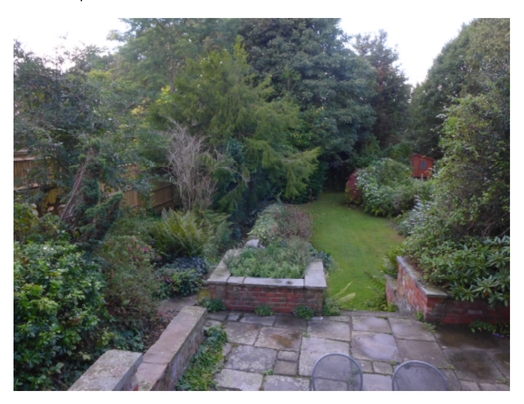
View towards garden from rear balcony