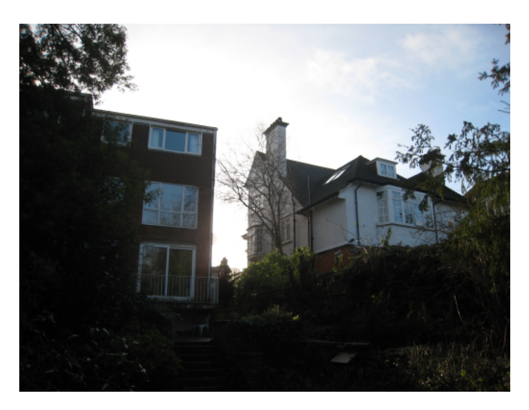
Relationship with no. 4