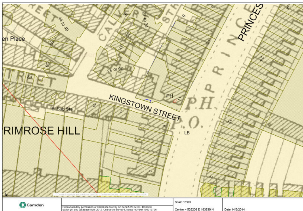
Historic map showing six cottages on the north side of Kingstown Street (behind the pub) before being cleared to make way for modern housing

The Albert Pub is a three-storey building located on the corner of Princess Road and Kingstown Street. It is not on the statutory list of historic buildings or locally listed but is in the Primrose Hill Conservation Area (as designated 1971). The ground floor operates as a pub and has an associated rear garden.