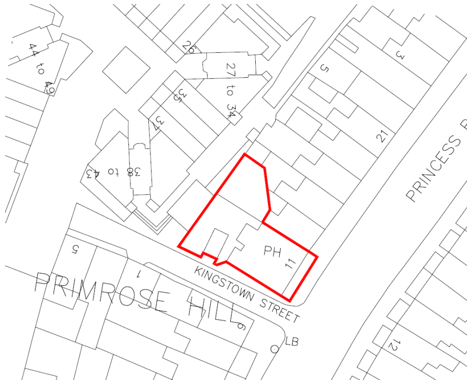
Location of The Albert Pub and rear garden

This Design & Access Statement has been prepared to support a planning application for a new conservatory in the garden of The Albert pub to replace the existing 1980s conservatory. It should be read in conjunction with the drawings submitted with this application.