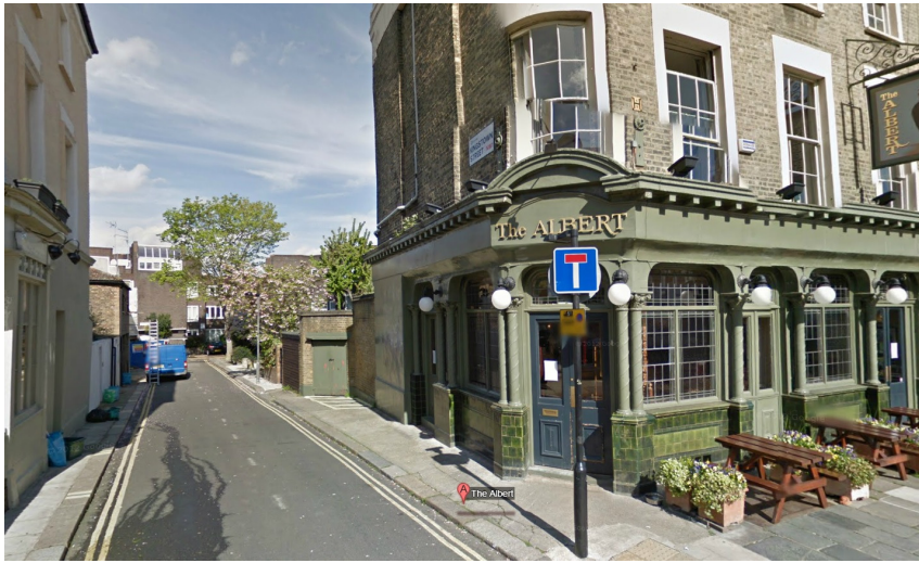
Albert Pub: Photograph facing west down Kingstown Street showing the existing wall and garage behind which the pub garden is located.

The Albert Pub is located to the east of Primrose Hill, to the north of Regents Park and is within The London Borough of Camden. The pub garden to the rear is separated from Kingstown Street by an existing 2-3m high brick wall and garage which is attached to the pub. The boundary to the rear of the garden is a low wall with metal fencing and shrubbery. Behind which there is a footpath, connecting Kingstown Street and Calvert Street, and a 1970s housing block (Auden Place).