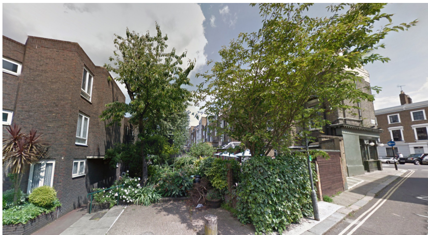
Albert Pub: Photograph north towards the footpath separating Auden Place (on the left) and the pub garden (middle behind trees). The slate and lead flashings of the existing conservatory roof can be seen.