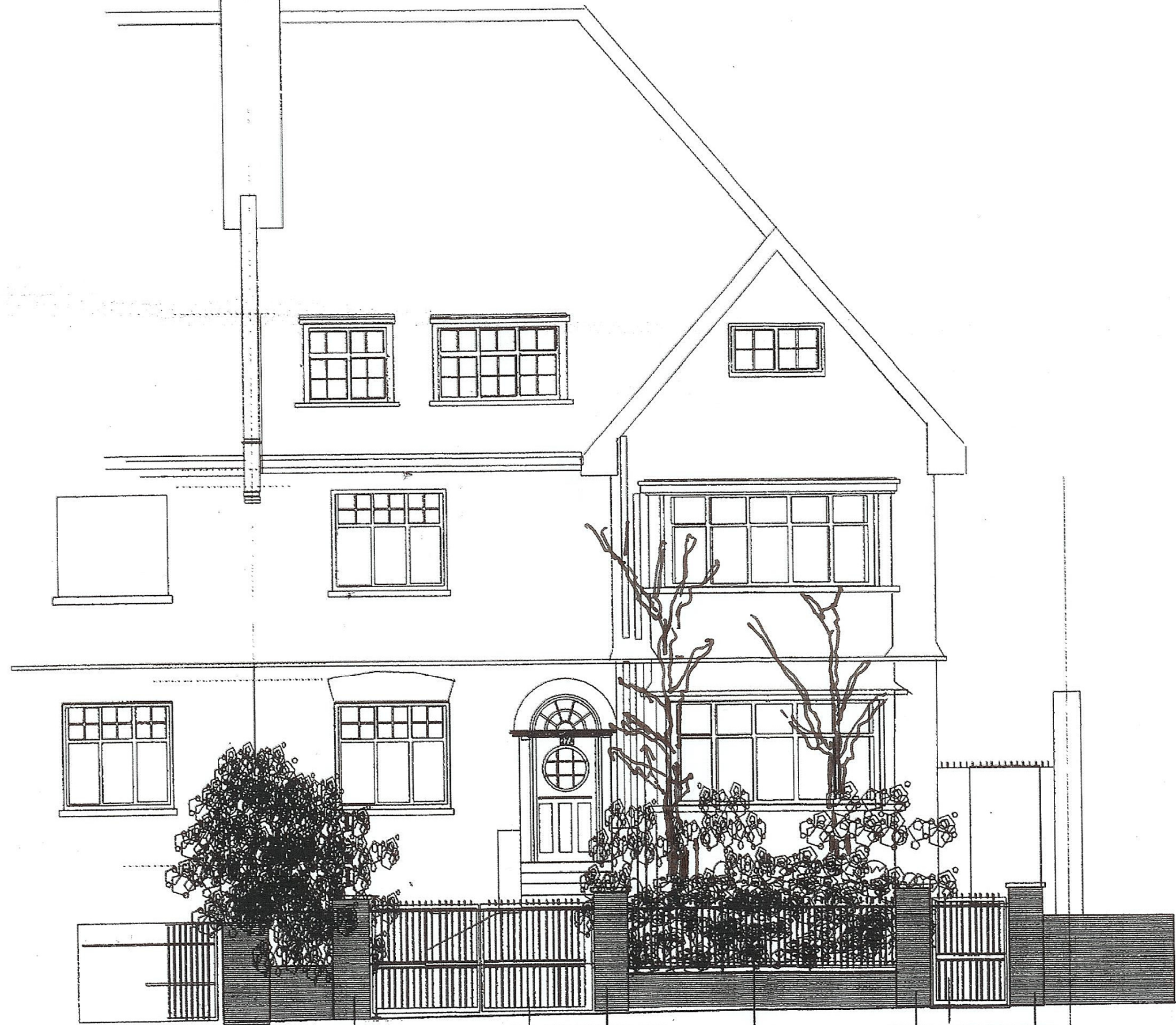
FRONT ELEVATION PROPOSED

Black painted mult folding gates New railings to match gates New matching pedestrian gate gate New brick piers raised from existing brickwork