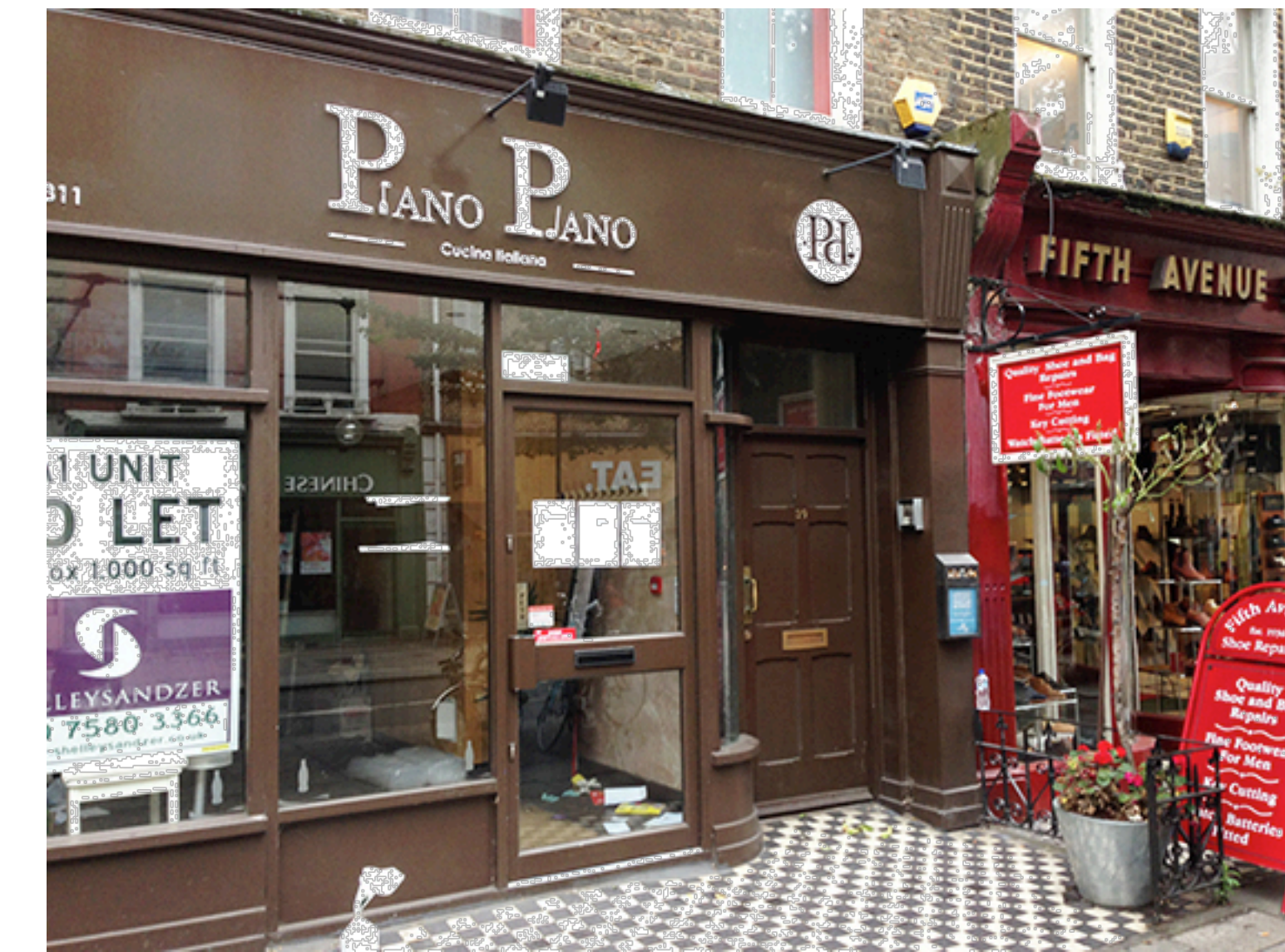
THE ABOVE IMAGE SHOWS SIGNAGE AS EXISTING WITH PROJECTING WALL WASHER LIGHTING