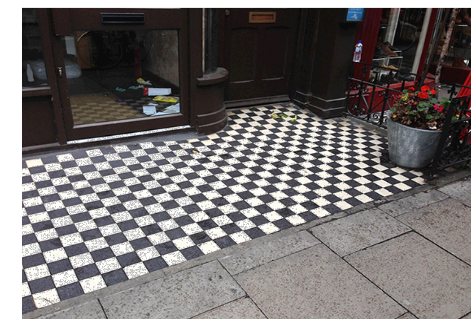
THE ABOVE IMAGE SHOWS TILING AS EXISTING AND RELATIONSHIP TO PAVEMENT

Do not scale from this drawing. All dimensions to be checked on site prior to manufacture. All dimensions to be measured to the face of the work. The client is responsible for providing all necessary information for approval. All building, structural and electrical work to comply with current building, structural and electrical regulations. The drawing is the property of Small Back Room. Copyright is reserved by Small Back Room and the drawing is issued on the condition that it is not copied, reproduced, altered or disclosed to any unauthorised person, either wholly or in part without the consent in writing of Small Back Room. All works to be carried out by a contractor competent to undertake the type of construction works indicated on this drawing. This drawing is to be made in accordance with the regulations produced for inclusion in the health and safety plan.