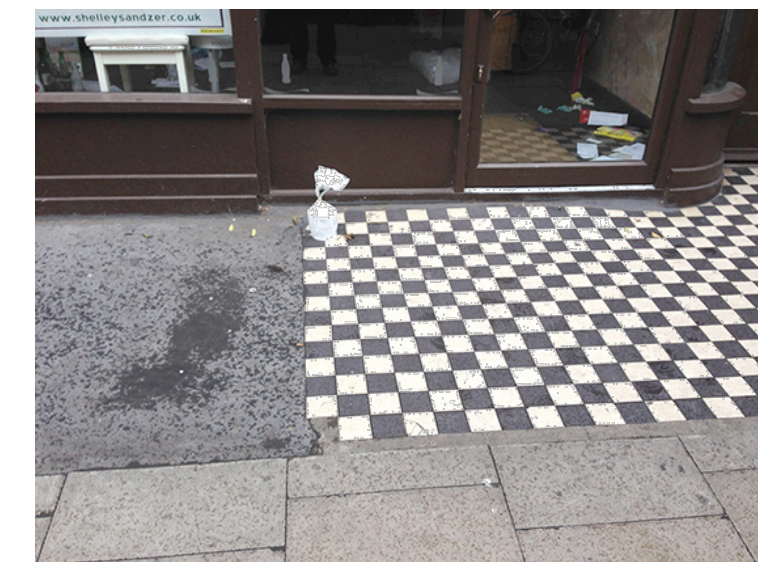
THE ABOVE IMAGE SHOWS TILING AS EXISTING WITH PART BITUMEN COVERING