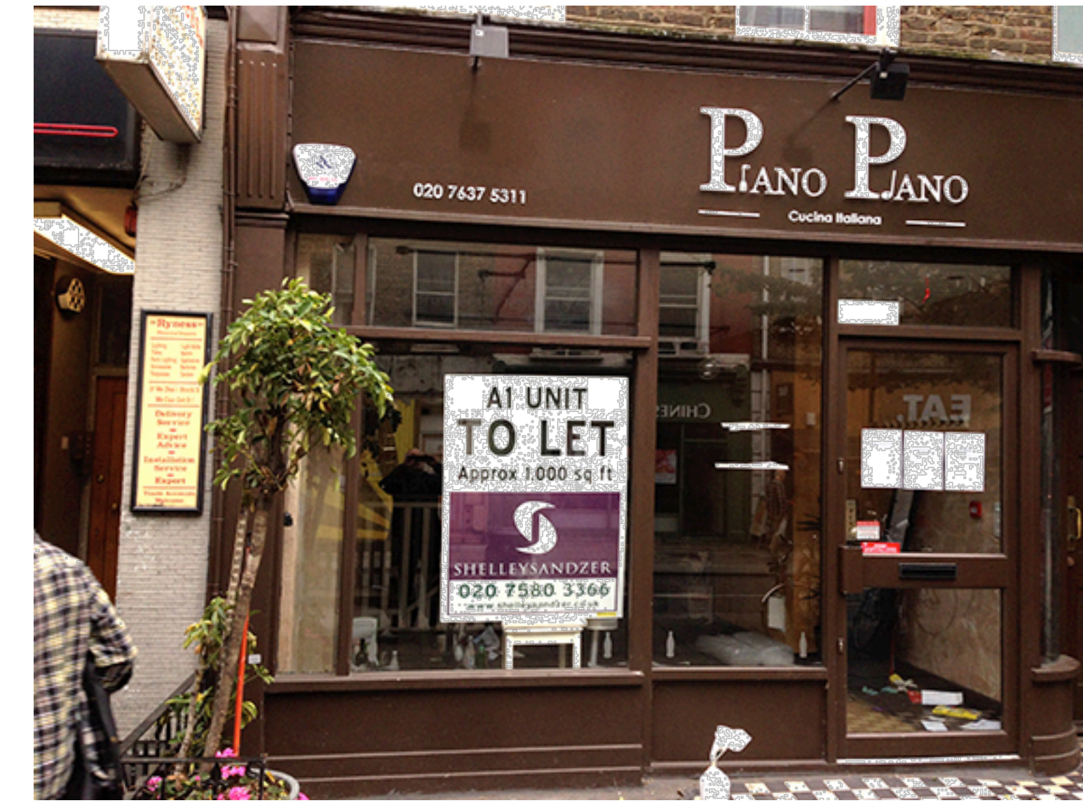
THE ABOVE IMAGE SHOWS SHOPFRONT AS EXISTING WITH PART TIMBER/PART ALUMINIUM ARRANGEMENT

EXISTING TIMBER SHOPFRONT EXISTING ALUMINIUM FRAMED DOOR CUT INTO TIMBER SHOPFRONT