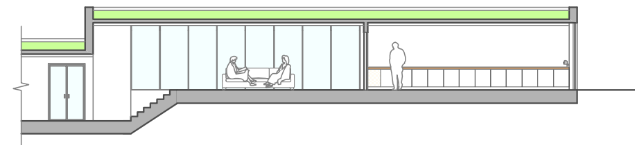
Part Section Through Proposed Extension