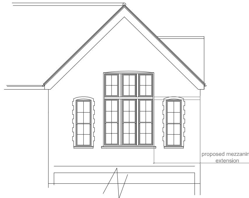
FRONT ELEVATION (RYLANDS ROAD)