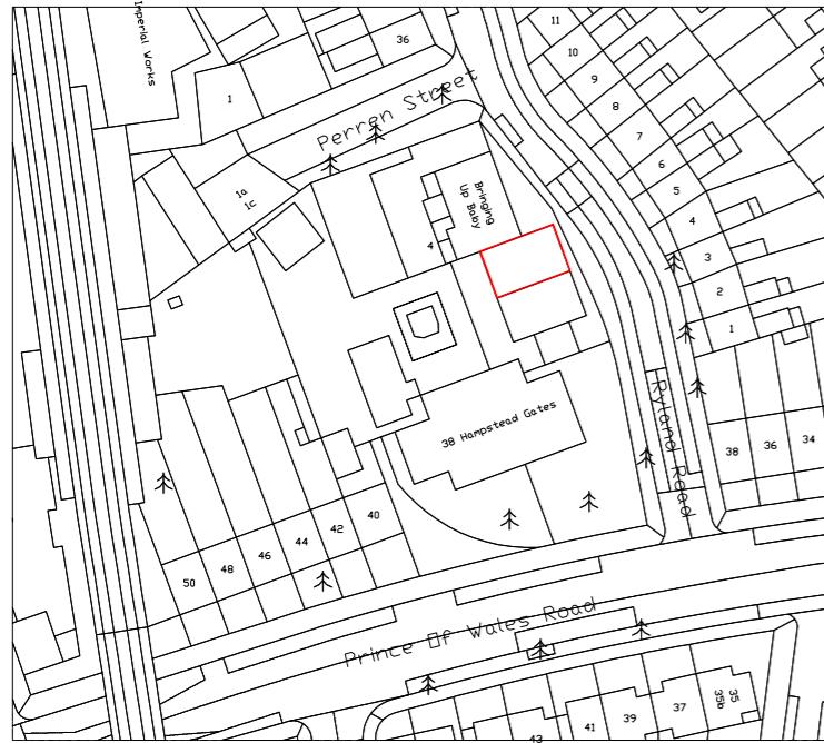
1 SITE LOCATION PLAN 1 : 1250

USE FIGURED DIMENSIONS ONLY. ALL DIMENSIONS MUST BE CHECKED ON SITE & ANY INCONSISTENCIES MUST BE REPORTED BACK TO THE ARCHITECT. THIS DRAWING AND ANY DESIGNS INDICATED THEREON ARE THE COPYRIGHT OF THE ARCHITECT. ALL RIGHTS ARE RESERVED. NO PART OF THIS WORK MAY BE REPRODUCED WITHOUT PRIOR PERMISSION IN WRITING FROM THE ARCHITECT.