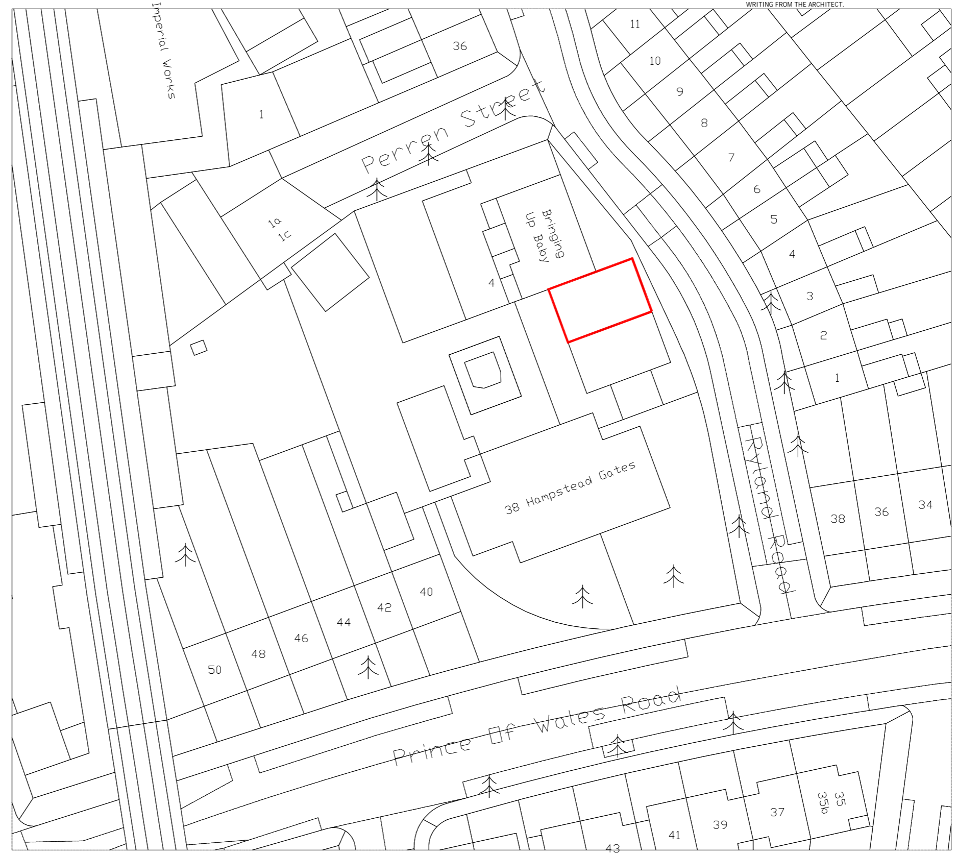
2 BLOCK PLAN 1 : 500