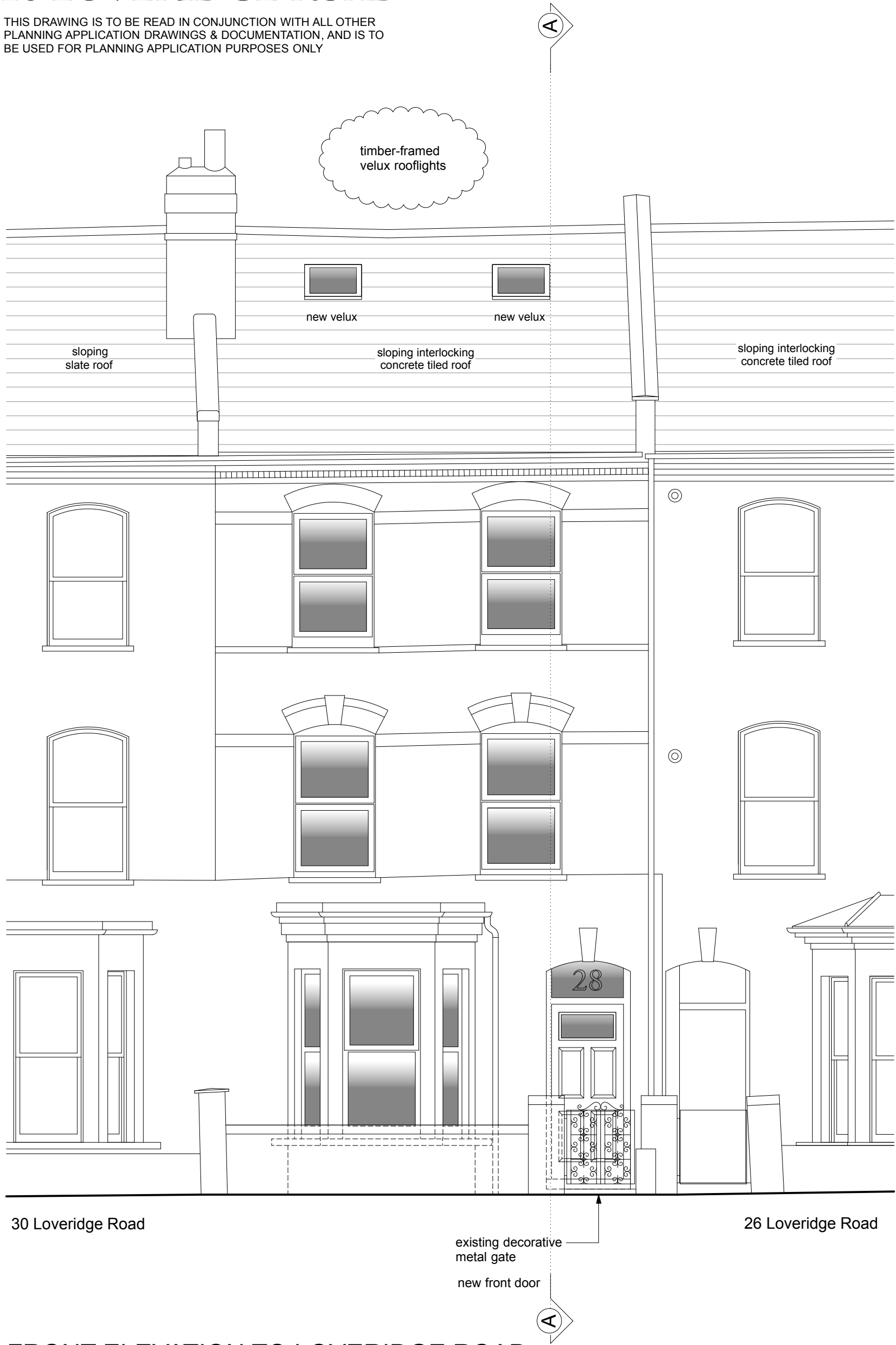
FRONT ELEVATION TO LOVERIDGE ROAD

THIS DRAWING IS TO BE READ IN CONJUNCTION WITH ALL OTHER PLANNING APPLICATION DRAWINGS & DOCUMENTATION, AND IS TO BE USED FOR PLANNING APPLICATION PURPOSES ONLY