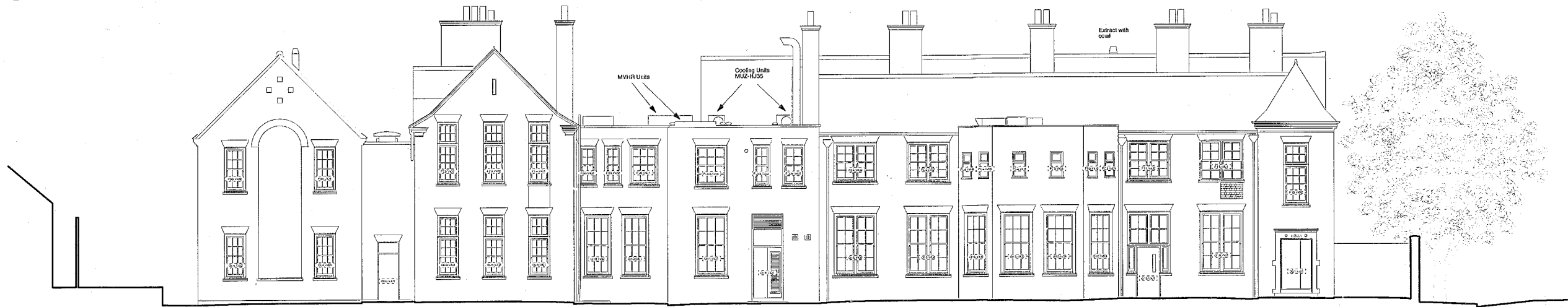
02 North Elevation