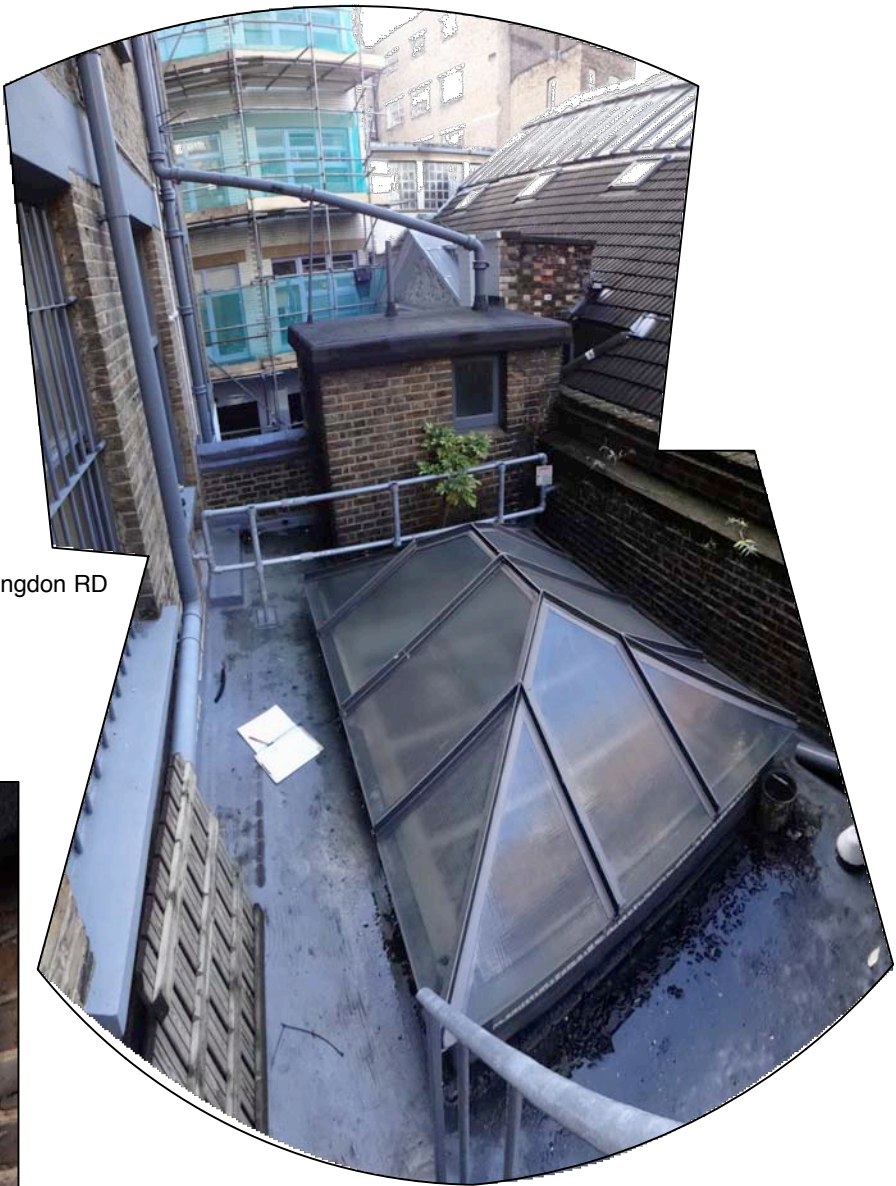
② View to site from party wall No. 63 Farringdon RD