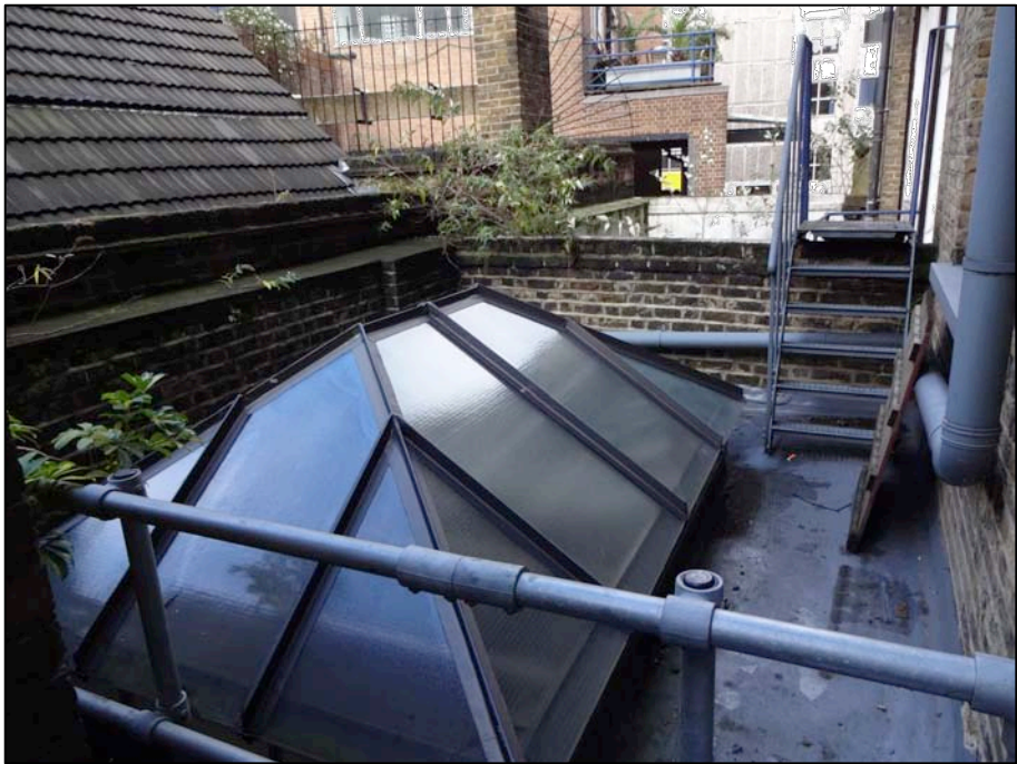
① 1st floor flat roof showing existing roof lantern, fire escape and party wall with No.63 Farringdon Rd