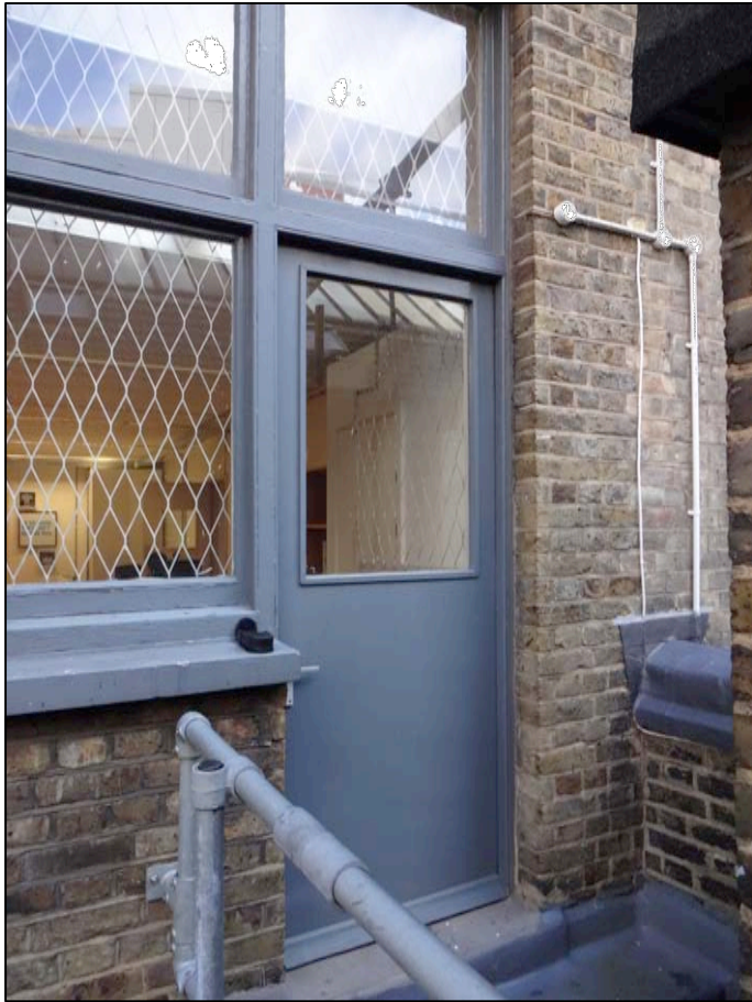
④ 1st floor flat roof access from commercial office space