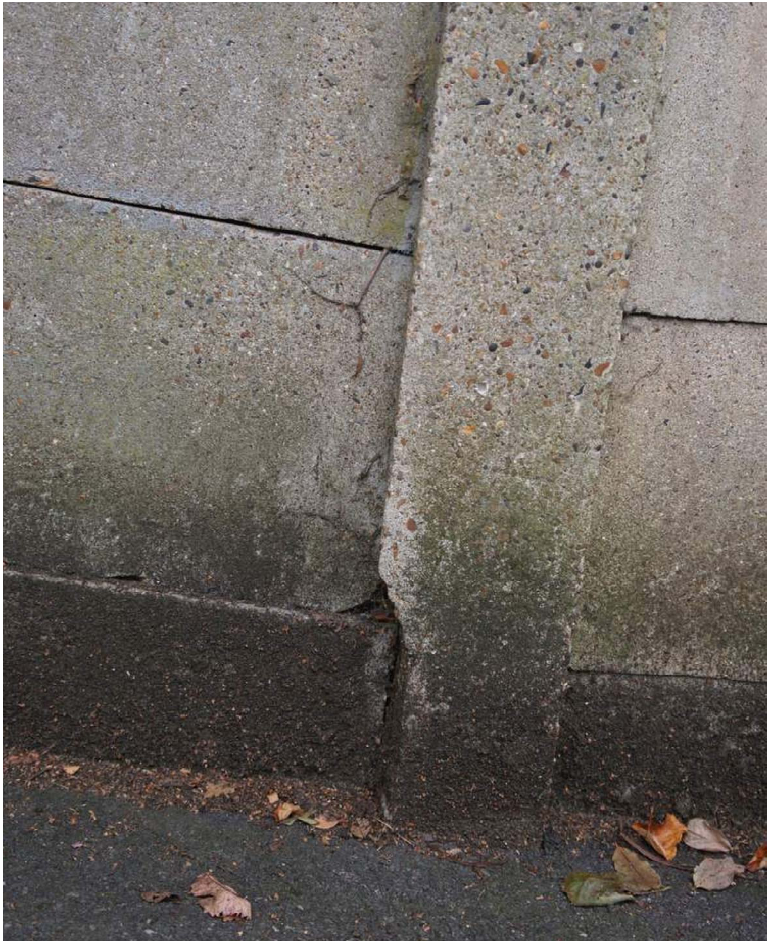
Photo 21 - Detail of existing concrete post bottom