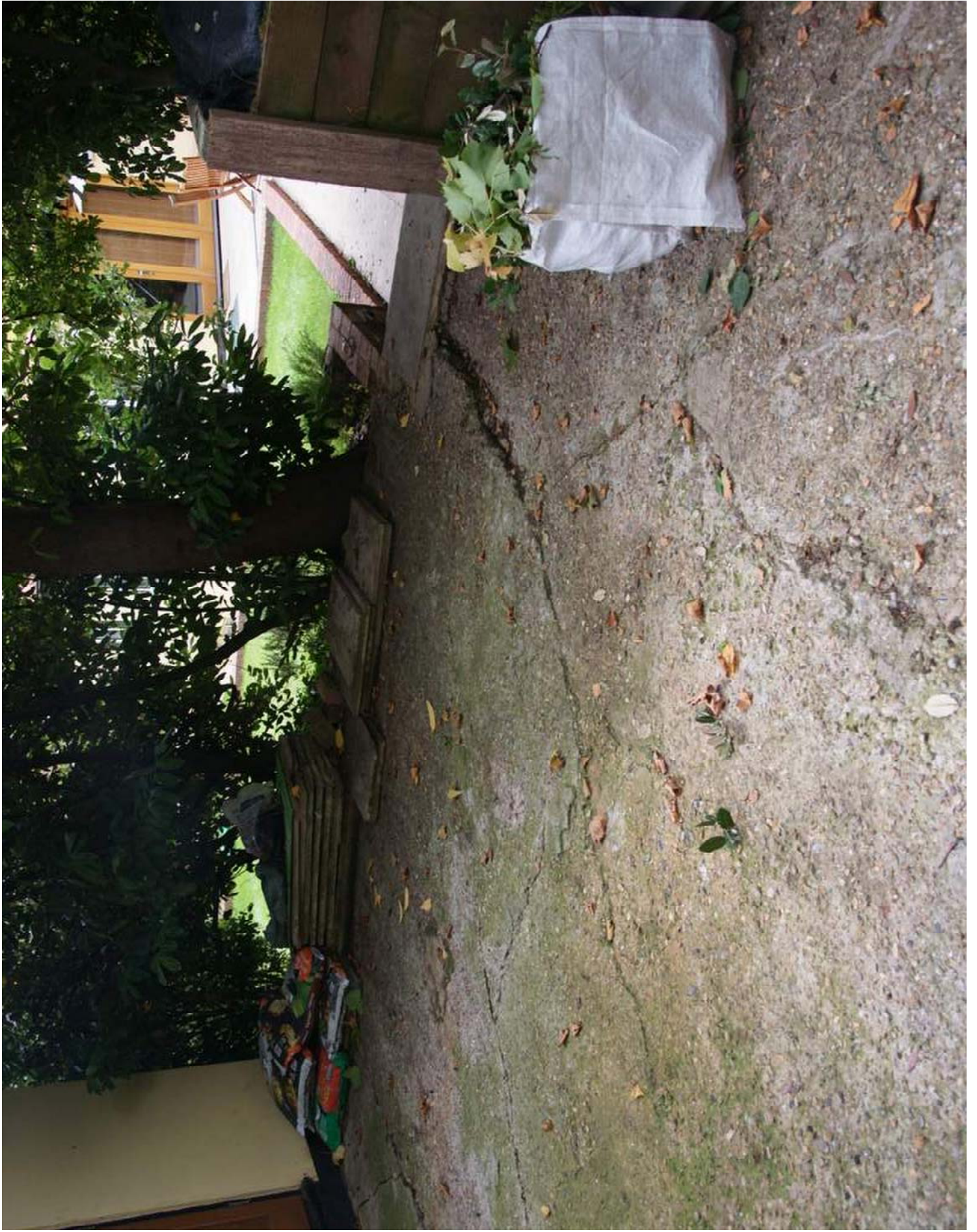
Photo 20 - Existing garage forecourt concrete, looing to house