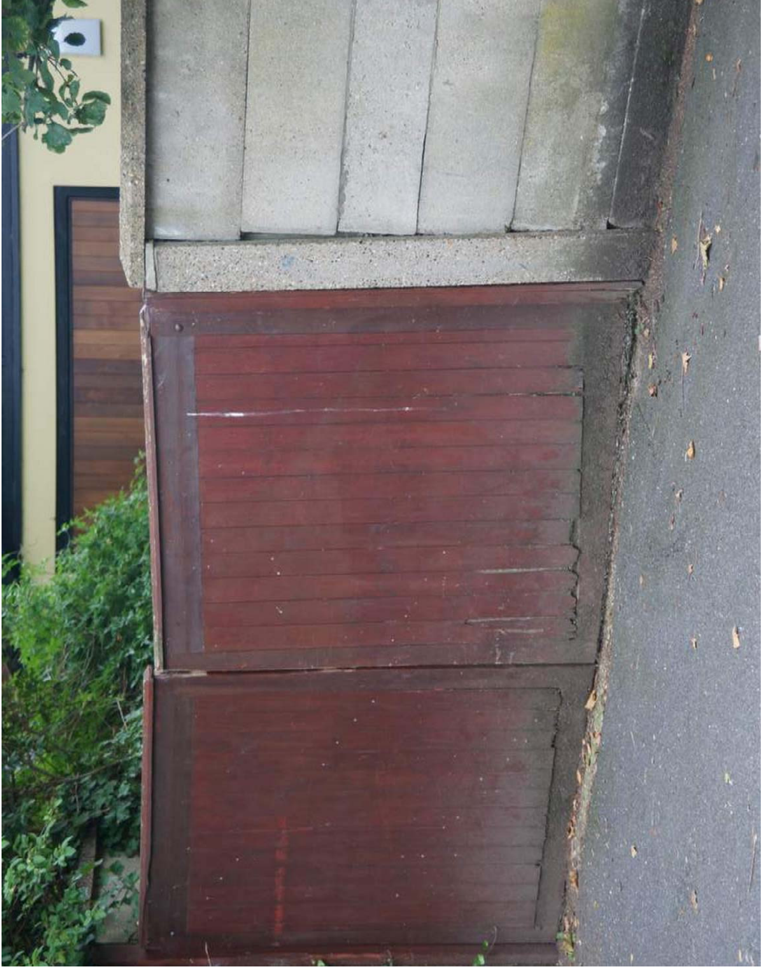
Photo 12 - Garage gates detail, St Albans Rd