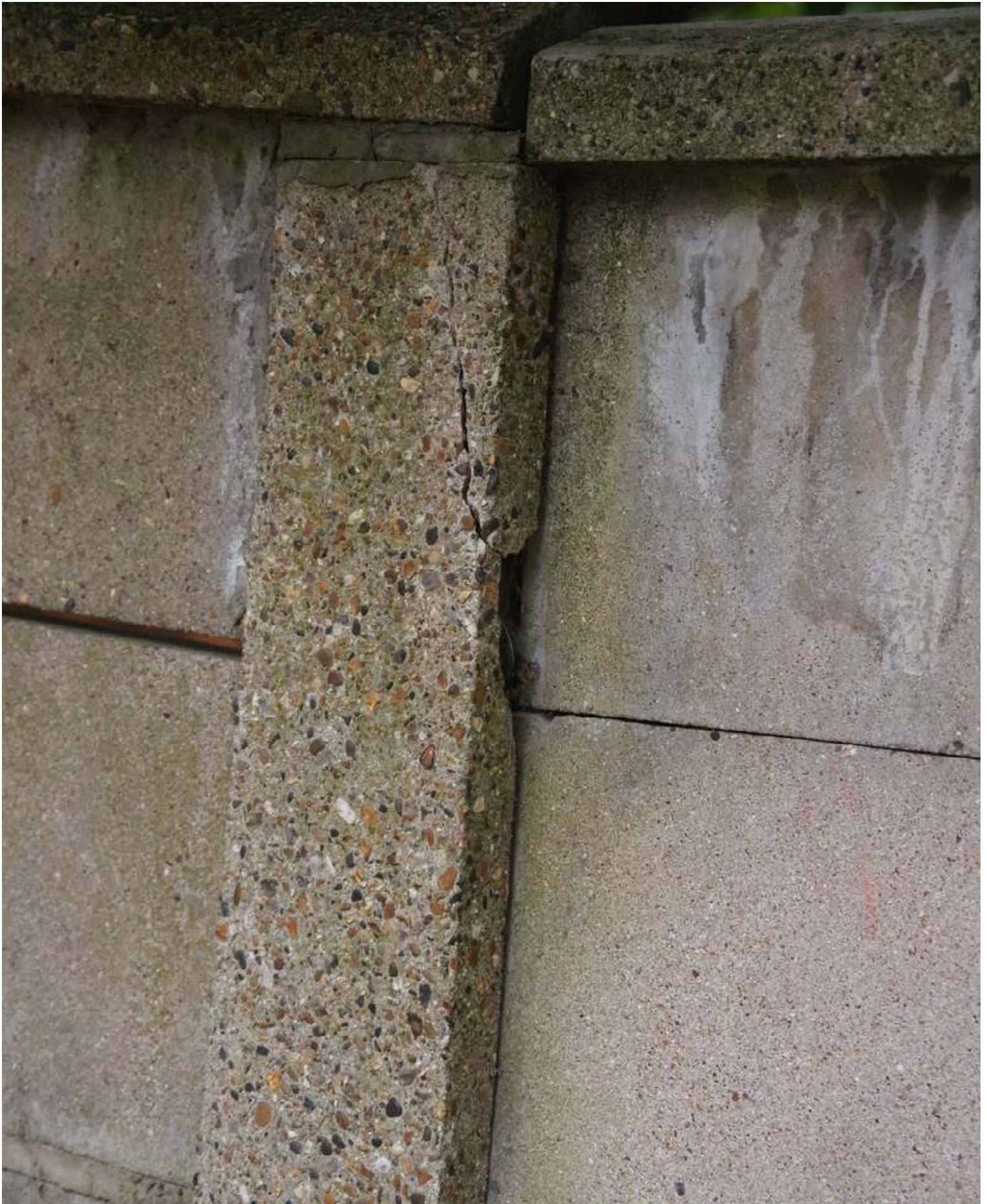
Photo 22 - Detail of existing concrete post top