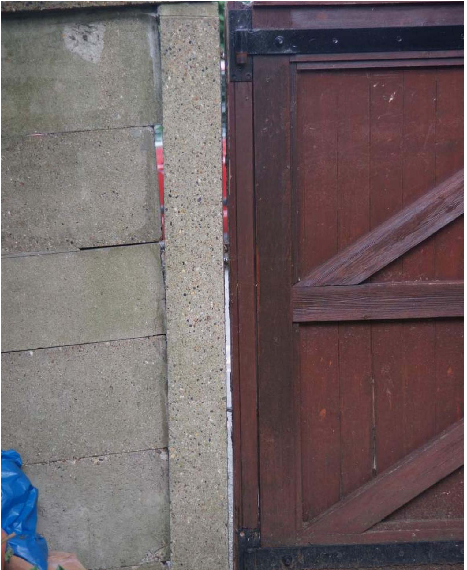
Photo 17 - detail of join between post and gate, taken from within 34 Brookfield Park