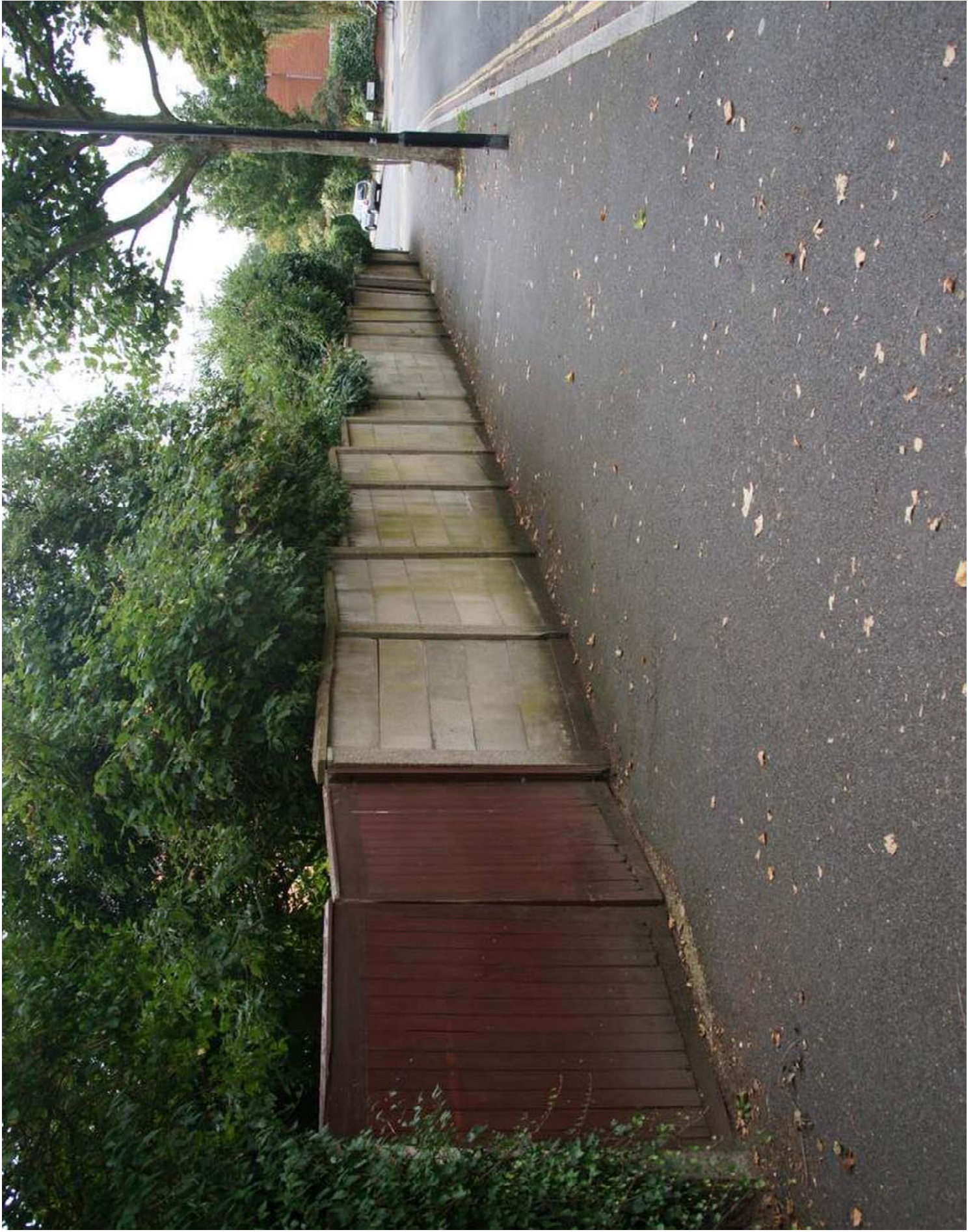
Photo 13 - Looking down St Albans Rd pavement, 34 Brookfield Park to left