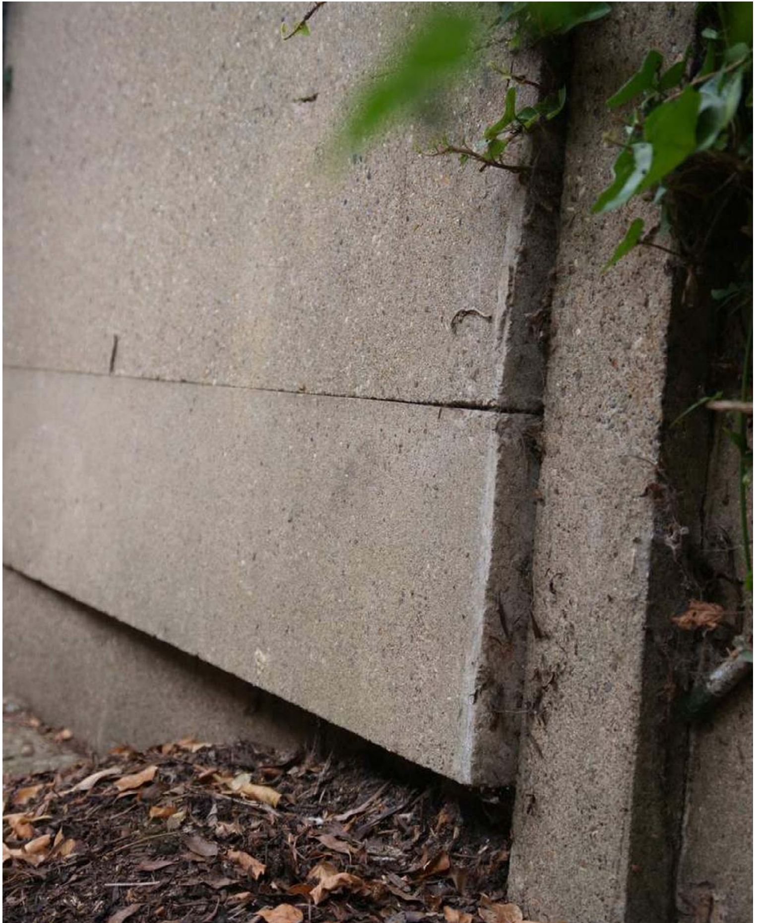
Photo 16 - Detail of concrete post and panel wall between 34 Brookfield Park and 47 Kingswear Road