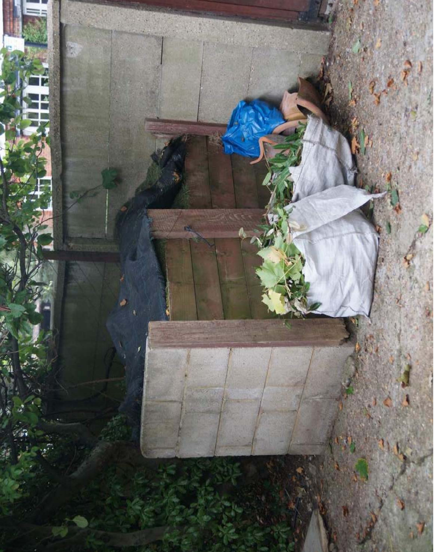
Photo 18 - Existing compost bins, 34 Brookfield Park