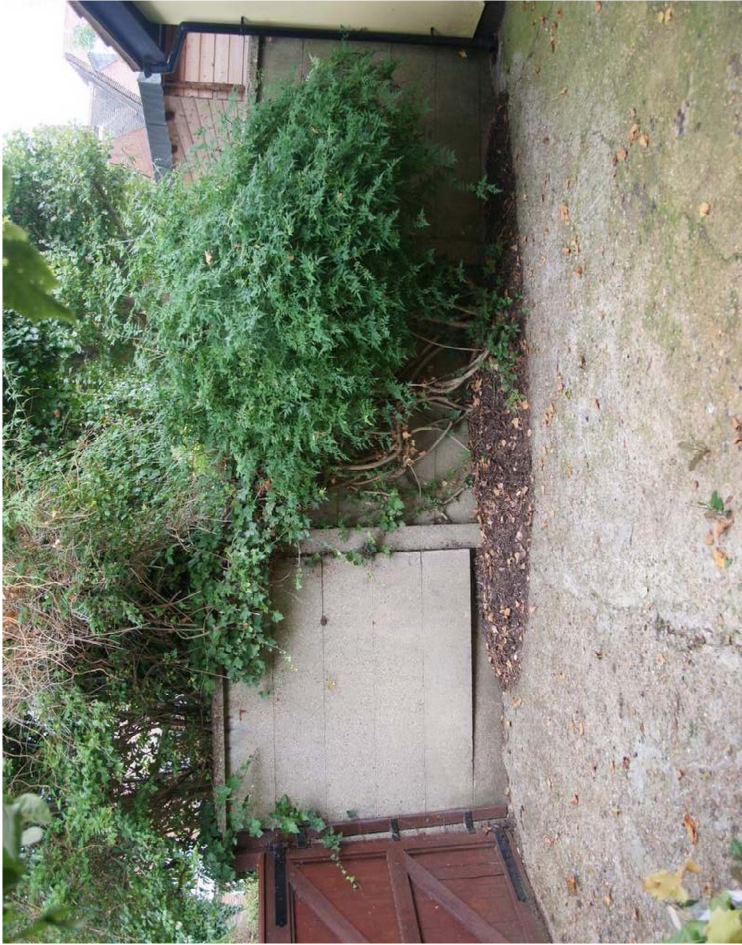
Photo 15 - Concrete post and panel wall between 34 Brookfield Park and 47 Kingswear Road