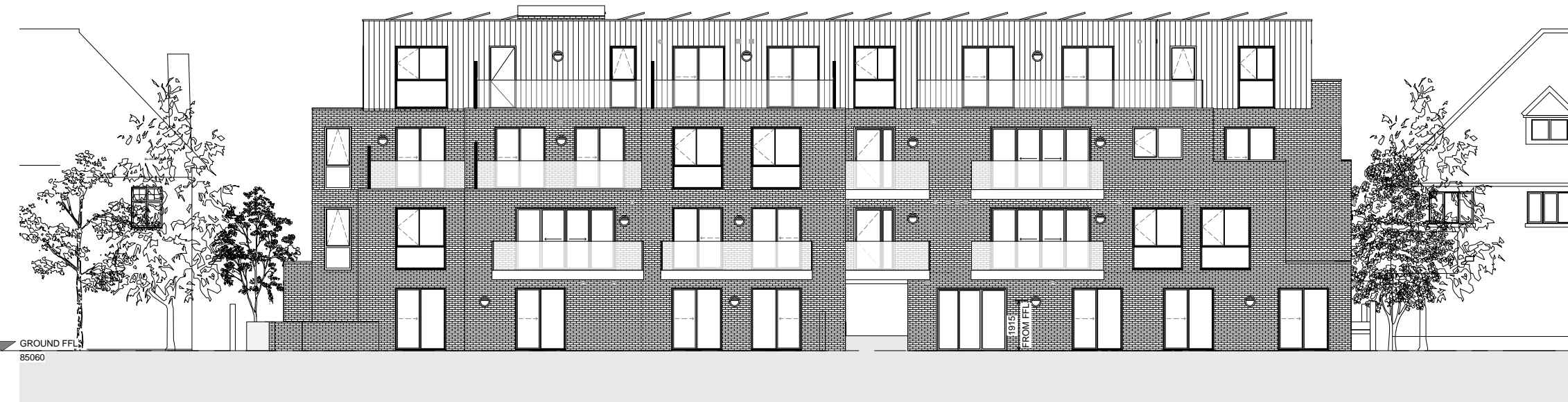
2 EAST ELEVATION - EXTERNAL LIGHTING LOCATIONS 1 : 100