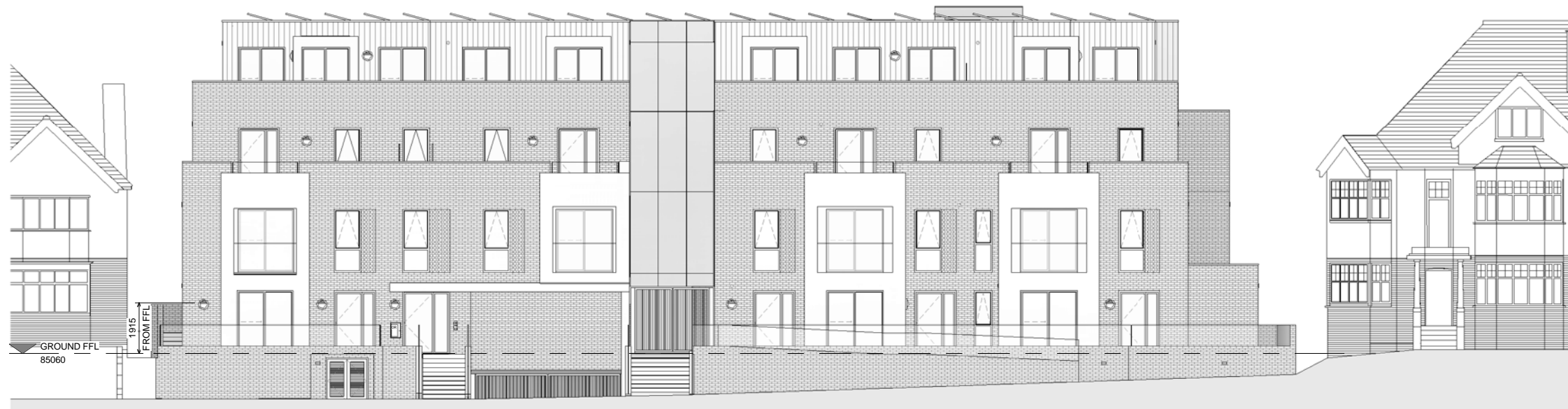
1 WEST ELEVATION - EXTERNAL LIGHTING LOCATIONS 1 : 100